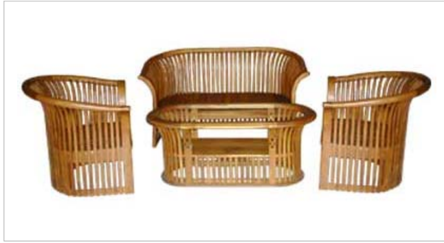
CODE: EB - 414 SOFA "KERANJANGAN" SET SIZE: TABLE ROUND : Ø 57 X H 48 (cm) TABLE OVAL: W 120 X D 57 X H 48 (cm) BENCH: W 150 X D 70 X H 75 (cm) CHAIR : W 86 X D 70 X H 75 (cm)