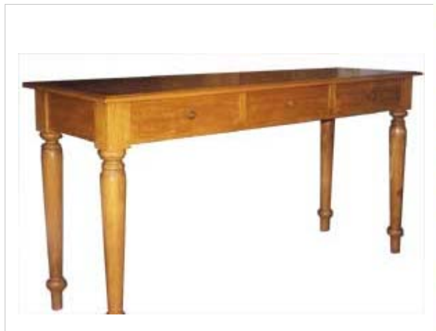
CODE: EB - 329 SIDE TABLE 3 DRAWER "BUBUT" SIZE: W 150 X D 50 X H 75 (cm)