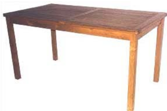
CODE: EB - 335 RECTANGULAR DINING TABLE SIZE: W 140 X D 80 X H 75 (cm)