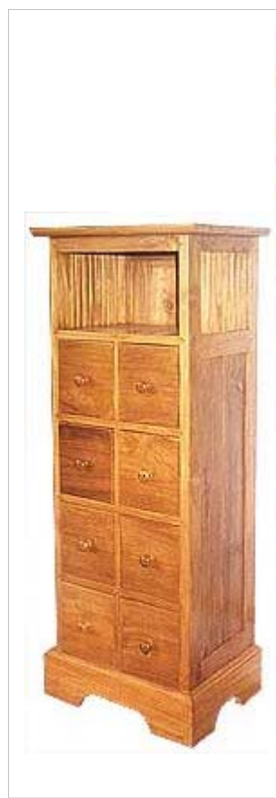
CODE: EB - 352 CD CABINET 8 DRAWERS SIZE: W X D X H (cm)