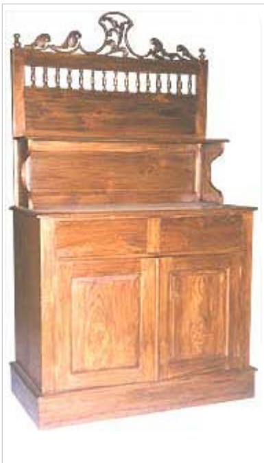
CODE: EB - 353 BUFFET SIZE: W 104 X D 50 X H 164 (cm)