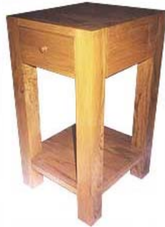
CODE: EB - 398 FLOWER TABLE 1 DRAWER WITH RACK SIZE: W 54 X D 54 X H 80 (cm)