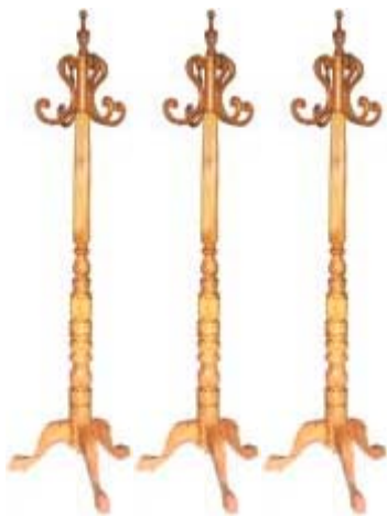
CODE: EB - 384 HAT / COAT HANGER SIZE: W 60 X D 54 X H 190 (cm)