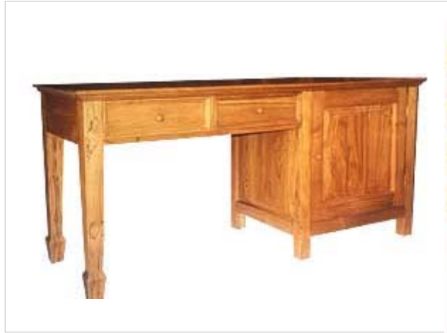
CODE: EB - 327 OFFICE TABLE 2 DRAWERS SIZE: W 160 X D 55 X H 75 (cm)