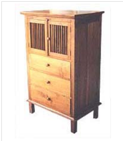
CODE: EB - 315 CAB 3 DRAWERS 2 DOORS SM SIZE: W 60 X D 40 X H 100 (cm)