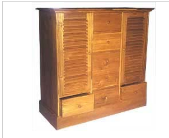
CODE: EB - 405 BUFFET 2 DOORS 7 DRAWERS SIZE: W 105 X D 45 X H 100 (cm)