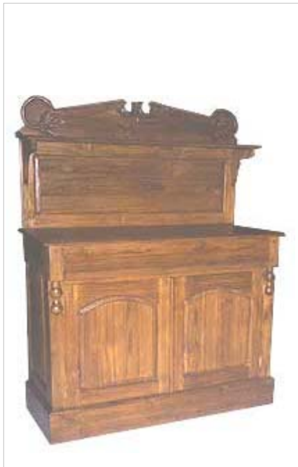
CODE: EB - 354 BUFFET 1 BIG DRAWER SIZE: W 118 X D 50 X H 160 (cm)