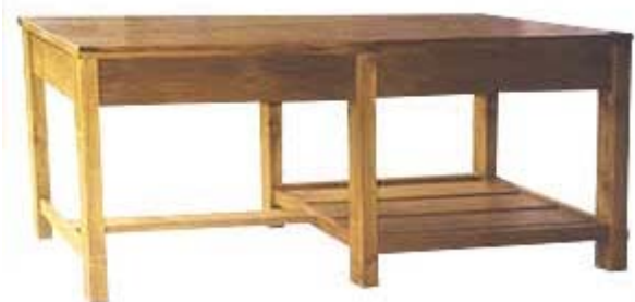
CODE: EB - 332 SIDE TABLE BOTTOM RACK SIZE: W 196 X D 56 X H 75 (cm)