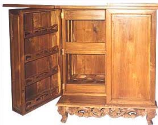
CODE: EB - 333 BAR CAB SIMPLE SIZE: W 80 X D 45 X H 103 (cm)