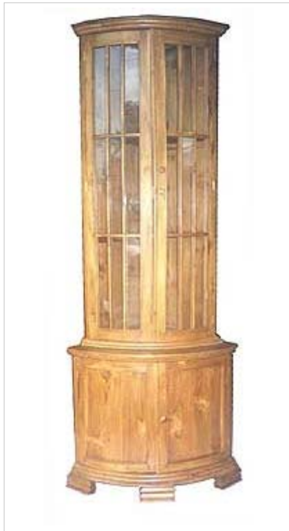
CODE: EB - 306 CORNER CABINET B SIZE: W 65 X D 65 X H 190 (cm)