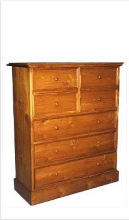
CODE: EB - 362 CABINET 7 DRAWERS SIZE: W 100 X D 45 X H 100, 110, 120