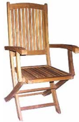
CODE: EB - 419 ASCOT ARM FOLDING CHAIR SIZE: W 55 X D 48 X H 100 (cm)