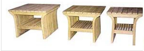
CODE: EB - 414B "KERANJANGAN" TABLE B SIZE: LARGE TABLE: W 65 X D 60 X H 45 (cm) MEDIUM TABLE: W 55 X D 50 X H 45 (cm) SMALL TABLE: W 45 X D 40 X H 45 (cm)