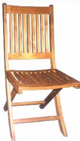
CODE: EB - 420 MILLENIUM FOLDING CHAIR SIZE: W 50 X D 43 X H 90 (cm)