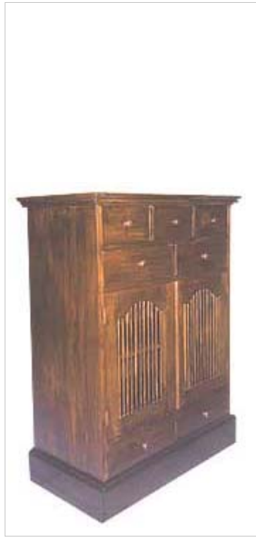
CODE: EB - 364 SM CAB 2 DRS 7 DRAWERS SIZE: W 75 X D 45 X H 99 (cm)