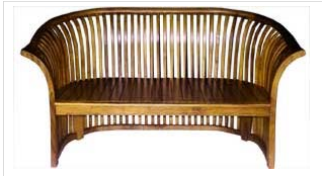
CODE: EB- 414B "KERANJANGAN" BENCH B SIZE: W 150 X D 70 X H 75 (cm)