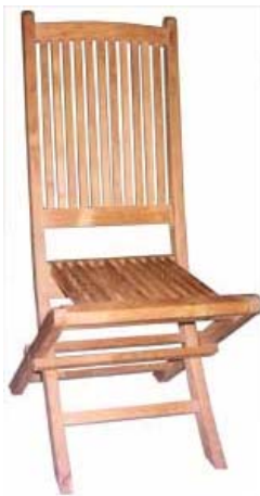
CODE: EB - 418 ASCOT FOLDING CHAIR SIZE: W 50 X D 45 X H 105 (cm)