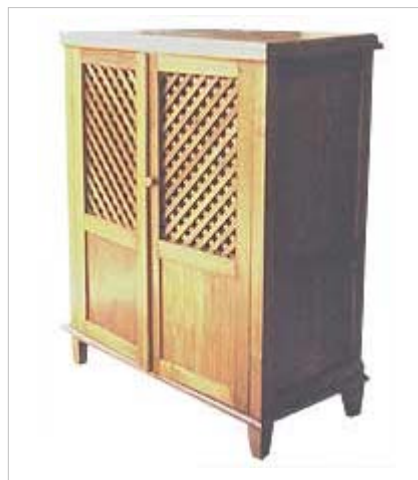
CODE: EB - 316 CABINET 2 DOORS SMALL SIZE: W 70 X D 40 X H 90 (cm)