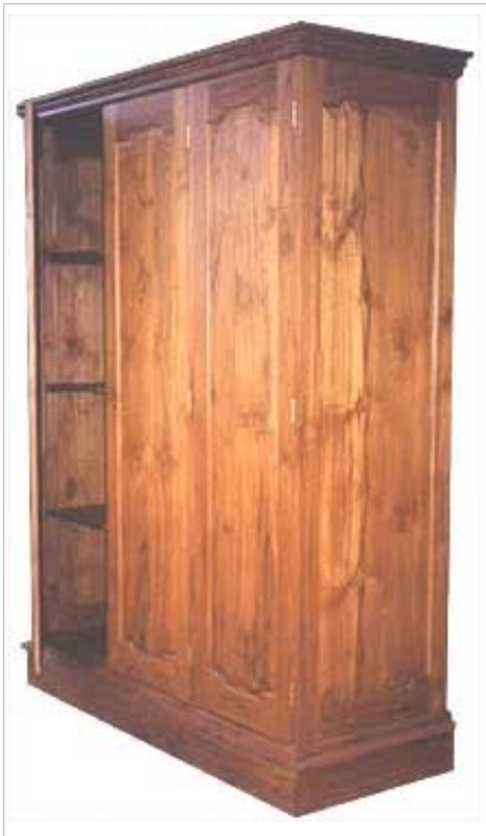
CODE: EB - 345 DRESSER 3 DOORS SIZE: W 160 X D 60 X H 220(cm)