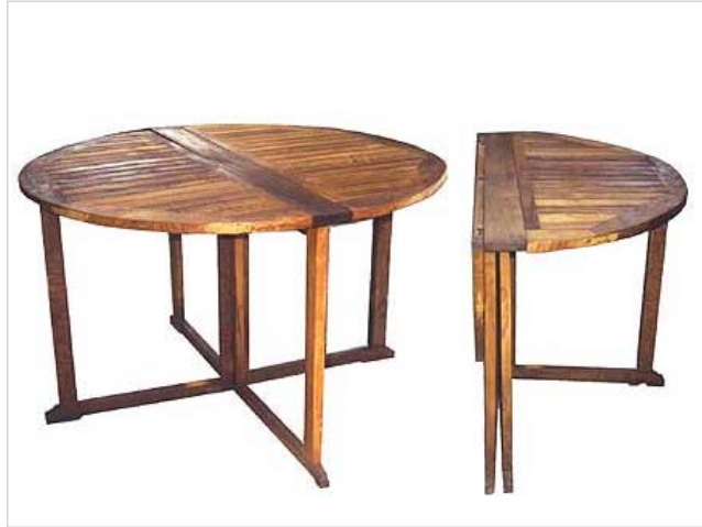
CODE: EB - 318 ROUND BUTTERFLY TABLE SIZE: Ø 120 X H 75 (cm)