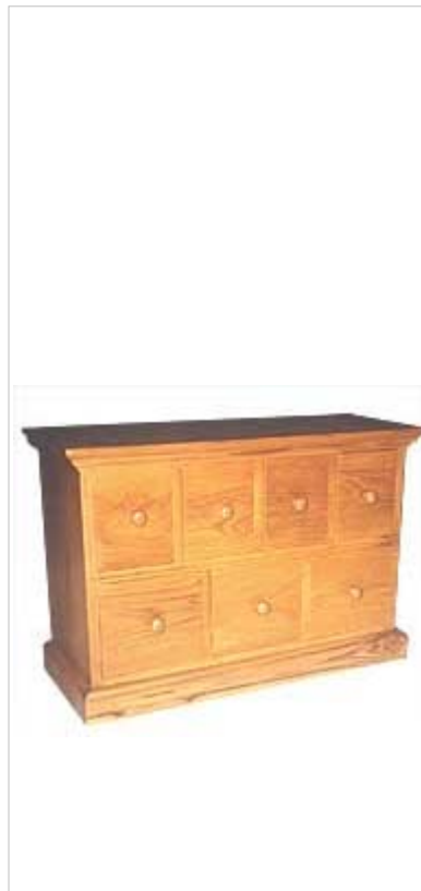
CODE: EB - 367 MINI CABINET 7 DRAWERS SIZE: W 60 X D 25 X H 40 (cm)