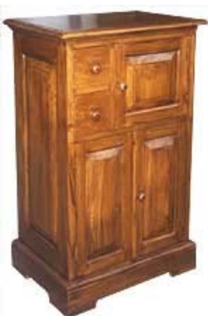
CODE: EB - 370 BED SIDE 3 DOORS 2 DRAWERS SIZE: W 52 X D 34 X H 85 (cm)