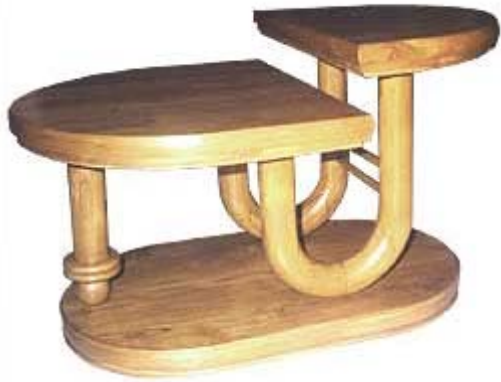
CODE: EB - 394 FLOWER TABLE OVAL SIZE: W X D X H (cm)