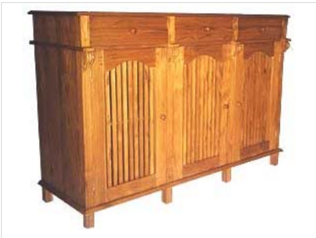
CODE: EB - 404 BUFFET FARISI 3 DOORS 3 DRAWERS SLAT SIZE: W 150 X D 50 X H 100 (cm)