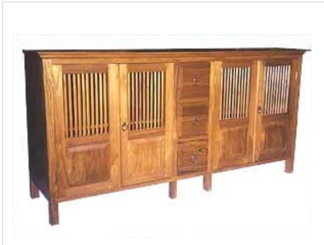
CODE: EB - 402 BIG BUFFET 4 DOORS 3 DRAWERS SIZE: W 180 X D 50 X H 90 (cm)