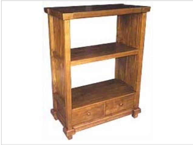
CODE: EB - 401 A BOOK CASE 2 DRAWERS BLOCK SIZE: W 79 X D 40 X H 110 (cm)