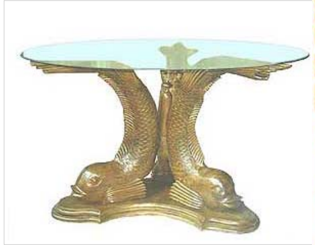
CODE: EB - 320 TRIPLE FISH GLASS TABLE SIZE: W 140 X D 140 X H 75 (cm)