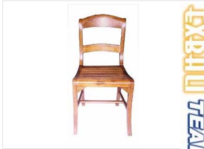
CODE: EB - 423 NONA CHAIR SIZE: W 45 X D 46 X H 91 (cm)