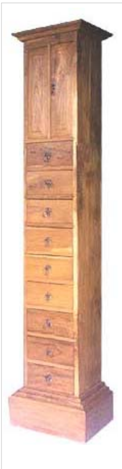
CODE: EB - 406 TALLCABINET SIZE: W 38 X D 34 X H 200 (cm)