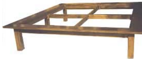
CODE: EB - 383 SIMPLE BED DOUBLE SIZE: W 224 X D 204 X H 40 (cm)