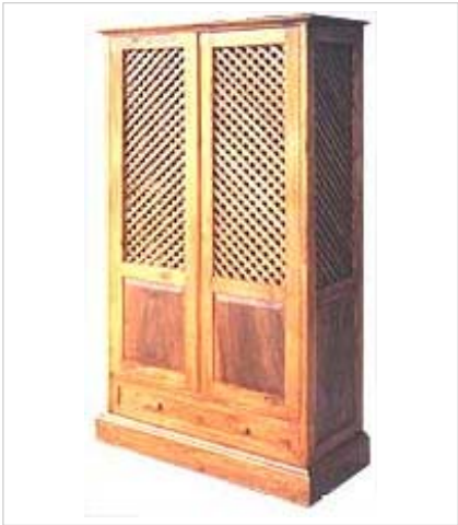
CODE: EB - 311 CABINET 2 DRAWERS 2 DOORS B SIZE: W X D X H (cm)