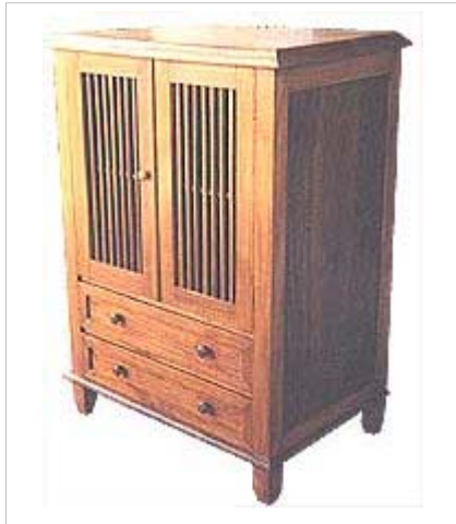
CODE: EB - 312 SM CABINET 2 DRAWERS 2 DOORS SIZE: W 60 X D 40 X H 100 (cm)