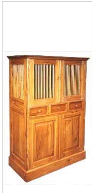
CODE: EB - 340 KITCHEN CAB 4 DOORS SIZE: W 90 X D 45 X H 140(cm)