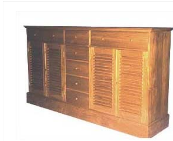
CODE: EB - 403 BIG BUFFET 4 DOORS 7 DRAWERS SIZE: W 180 X D 45 X H 100 (cm)