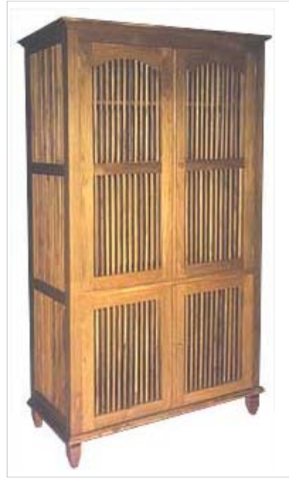
CODE: EB - 409 DINING CAB 2 DOORS SLAT SIZE: W 105 X D 48 X H 190 (cm)