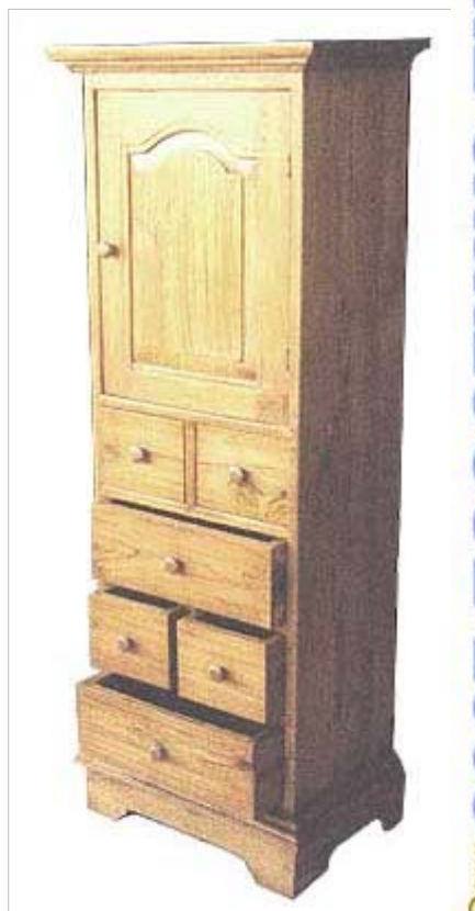
CODE: EB - 310 SMALL CABINET6 DRAWERS SIZE: W 40 X D 30 X H 130 (cm)