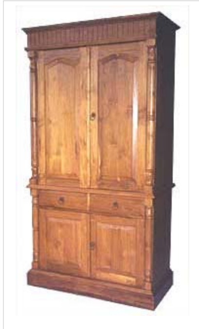
CODE: EB - 408 CAB 4 DOORS 2 DRAWERS SIZE: W 95 X D 50 X H 190 (cm)