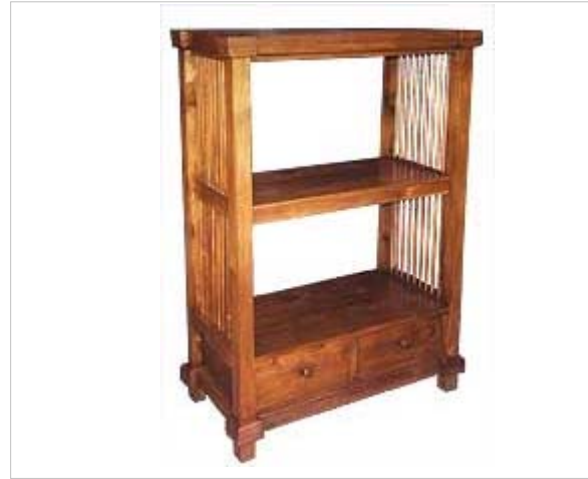
CODE: EB - 401 B BOOK CASE 2 DRAWERS SLAT SIZE: W 79 X D 40 X H 110 (cm)