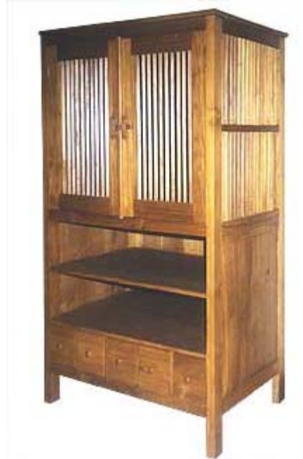
CODE: EB - 338 A TV CABINET "RACAK" 5 DRAWS SIZE: W 100 X D 61 X H 160 (cm)