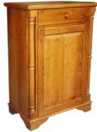
CODE: EB - 375 SMALL CABINET 1 DOOR 1 DRAWER SIZE: W 60 X D 40 X H 100 (cm)