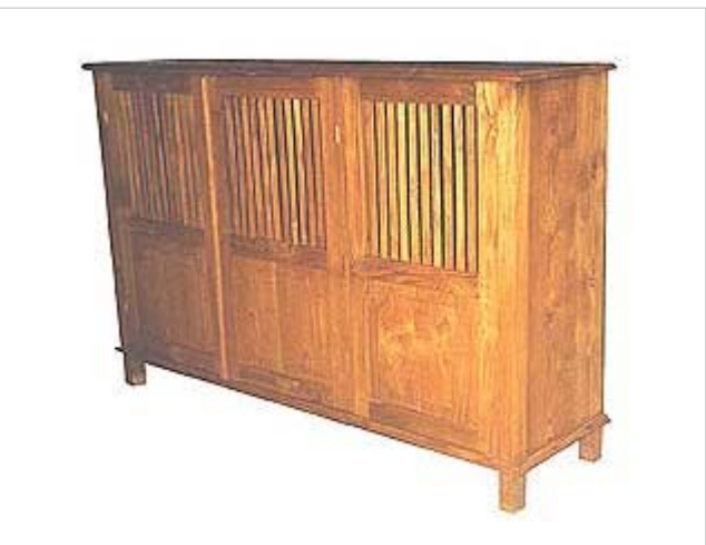
CODE: EB - 360 BUFFET 3 DOORS SIZE: W X D X H (cm)