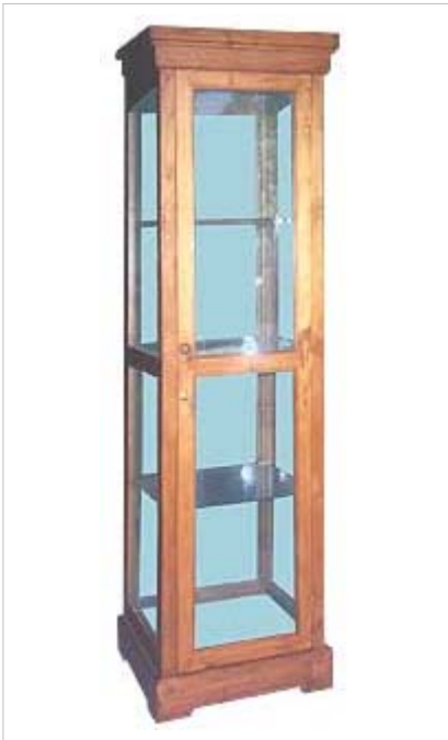
CODE: EB - 407 SQUARE GLASS CABINET SIZE: W 46 X D 46X H 180,200 (cm)