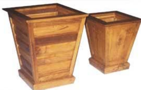
CODE: EB - 373A & EB - 373 B BIG WASTE BOX & SMALL WASTE BOX SIZE: W 40,31 X D 40,31 X H 45,36 (cm)