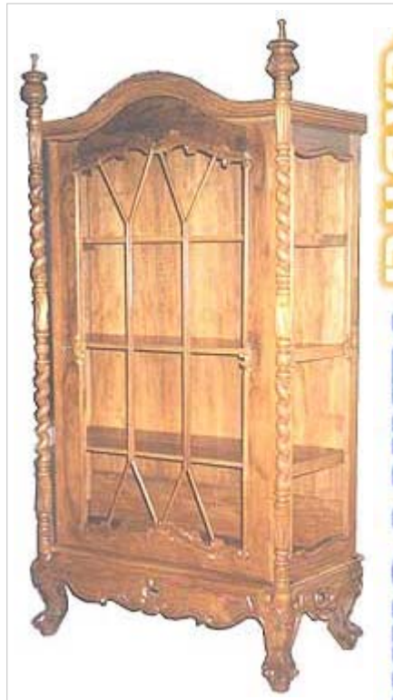
CODE: EB - 307 CABINET " PILLIAR SIZE: W 110 X D 40 X H 200 (cm)