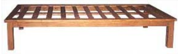
CODE: EB - 381 SIMPLE BED SINGLE SIZE: W 220 X D 90 X H 45 (cm)