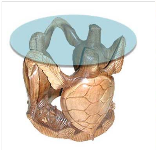
CODE: EB - 342TT 3 TURTLE TABLE SIZE: W X D X H (cm)