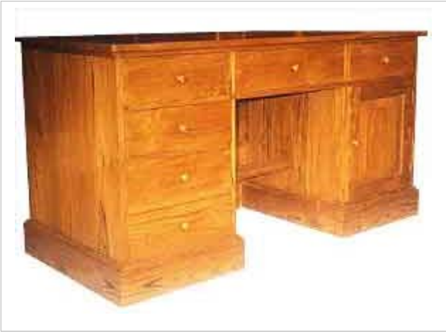
CODE: EB - 326 OFFICE TABLE 6 DRAWERS SIZE: W 150X D 75 X H 80 (cm)