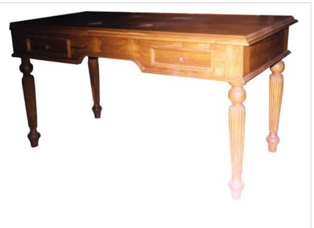
CODE: EB - 432 OFFICE TABLE "ULIR" 2 DRAWERS SIZE: W 150 X D 75 X H 77 (cm)