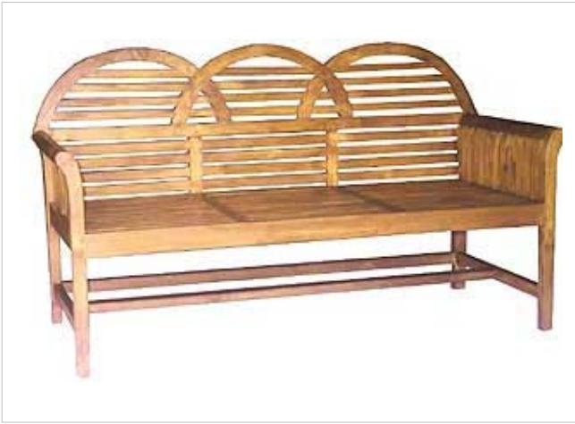
CODE: EB - 428 TRIPLE DOM BENCH SIZE: W 157 X D 56 X H 91 (cm)