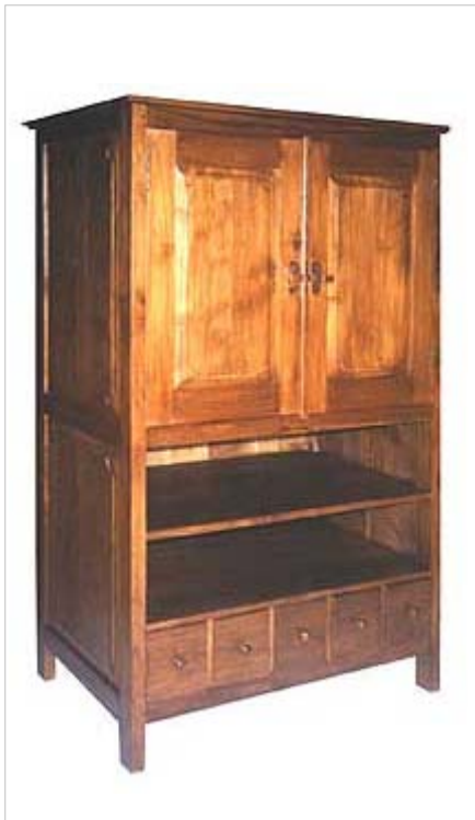
CODE: EB -338 B TV CABINET 5 DRAWERS SIZE: W 100 X D 61 X H 160(cm)