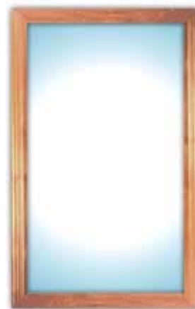
CODE: EB - 379 FRAME PROFILE+ BEVEL MIRROR SIZE: W 80X D 10 X H 115 (cm)