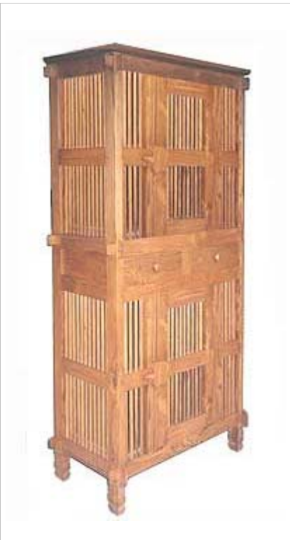
CODE: EB - 305 CABINET 2DRAWERS SIZE: W 100 X D 40 X H 190 (cm)