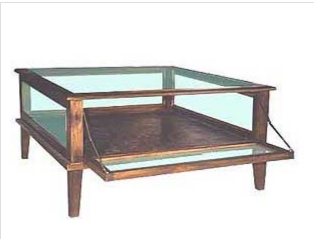
CODE: EB - 330 GLASS COFFEE TABLE BIG SIZE: W 100 X D 100 X H 50 (cm)