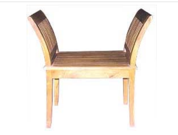
CODE: EB - 426 ROMAN LX CHAIR SIZE: W 74 X D 40 X H 77 (cm)