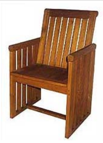
CODE: EB - 387 HONG KONG CHAIR SIZE: W 55 X D 50 X H 95 (cm)