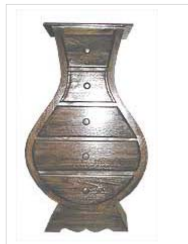
CODE: EB - 340B VASE CABINET B SIZE: W 75 X D 28 X H 110 (cm)