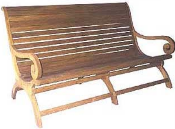
CODE: EB - 389 LAZY BENCH SIZE: W 200 X D 90 X H 105 (cm)