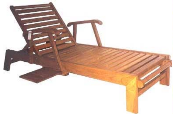
CODE: EB - 377 SUNBED WITH ARM SIZE: W 200 X D 97 X H 75 (cm)