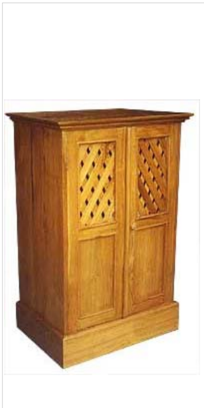
CODE: EB - 365 SMALL CABINET 2 DOORS SIZE: W X D X H (cm)