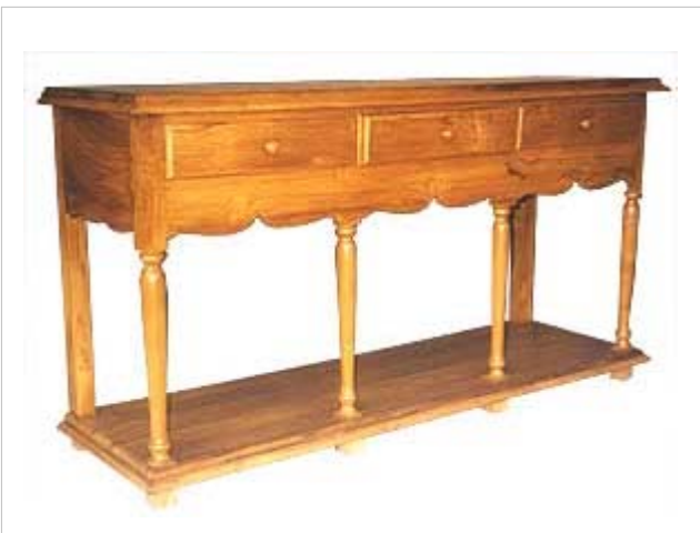
CODE: EB - 328 SIDE TABLE 3 DRAWER "BUBUT" SIZE: W 150 X D 50 X H 75 (cm)