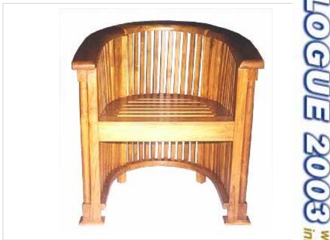
CODE: EB - 427 BAUHAUS "BUBUT" CHAIR SIZE: W 72 X D 54 X H 82 (cm)