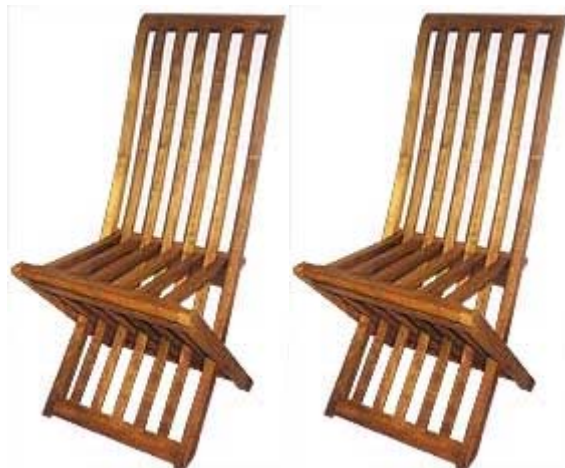
CODE: EB - 385 YUDITH FOLDING CHAIR SIZE: W 45 X D 65 X H 100 (cm)