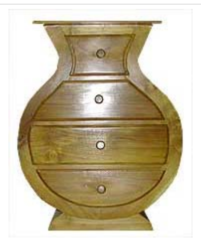
CODE: EB - 340A VASE CABINET A SIZE: W 90 X D 28 X H 110(cm)

Web www.exbali.com Email info@exbali.com