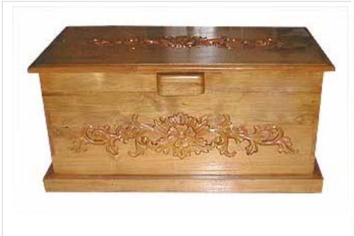
CODE: EB - 320E BLANKET / GLORY BOXES / CHESTS SIZE: W 110 X D 55 X H 55 (cm)