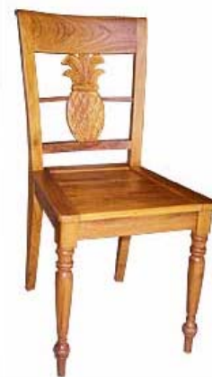
CODE: EB - 421 PINEAPPLE CHAIR SIZE: W 46 X D 50 X H 92 (cm)