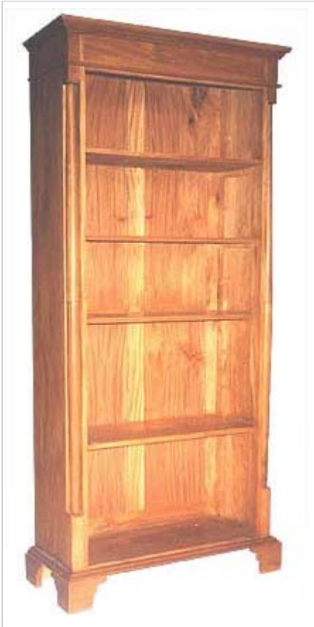
CODE: EB - 350 BOOK CASE MAHOGANY SIZE: W X D X H (cm)