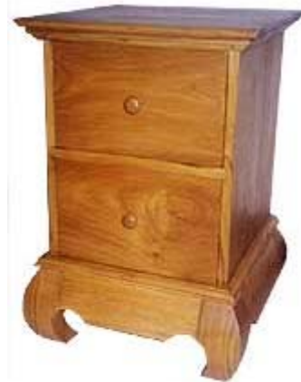
CODE: EB - 390 BED SIDE OPIUM 2 DRAWS SIZE: W 40 X D 40 X H 60 (cm)