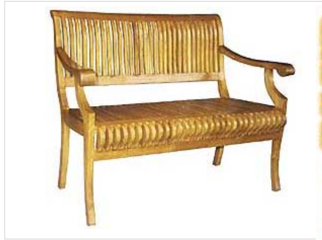
CODE: EB - 429 CASTLE BENCH SIZE: W 116 X D 65 X H 90 (cm)