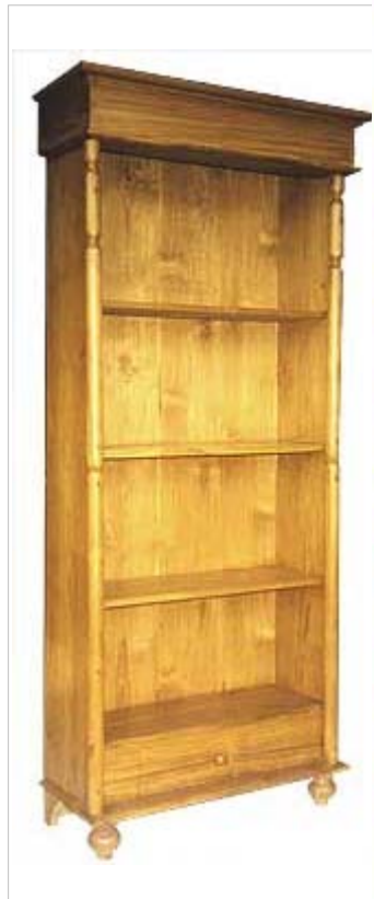
CODE: EB - 349 BOOK CASE 1 DRAWER SIZE: W X D X H (cm)