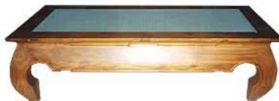
CODE: EB - 336 OPIUM RATTAN TABLE WITH GLASS SIZE: W 100 X D 100 X H 35 (cm)