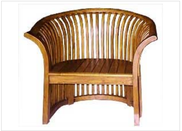
CODE: EB - 414B "KERANJANGAN" CHAIR SIZE: W 86 X D 70 X H 75 (cm)