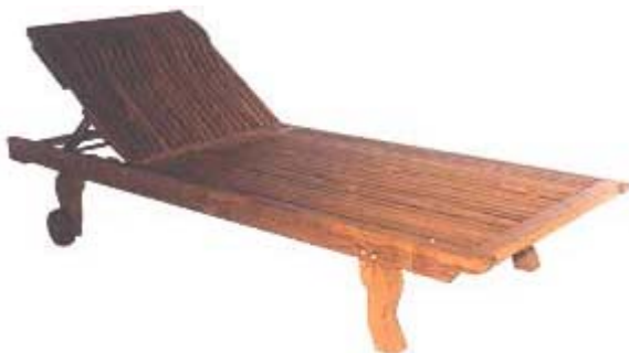
CODE: EB - 378 SUNBED COBRA SIZE: W 200 X D 85 X H 70 (cm)