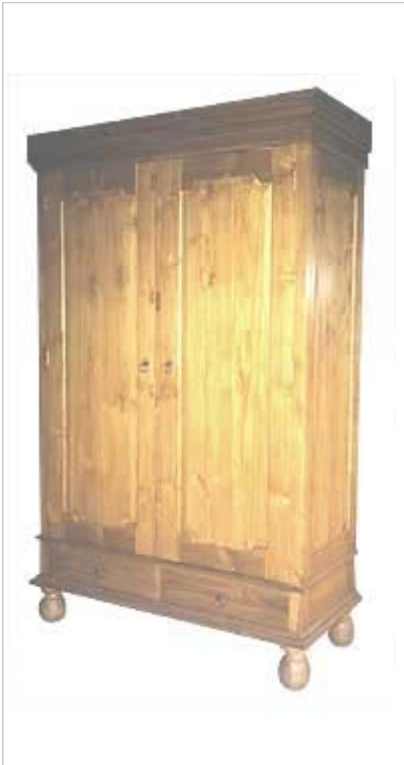
CODE: EB - 344 DRESSER 2 DOORS SIZE: W 125 X D 57 X H 204 (cm)