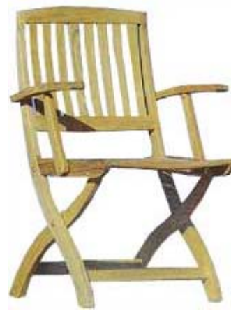
CODE: EB - 417 BARTON ARM FOLDING CHAIR SIZE: W 56 X D 45 X H 90 (cm)