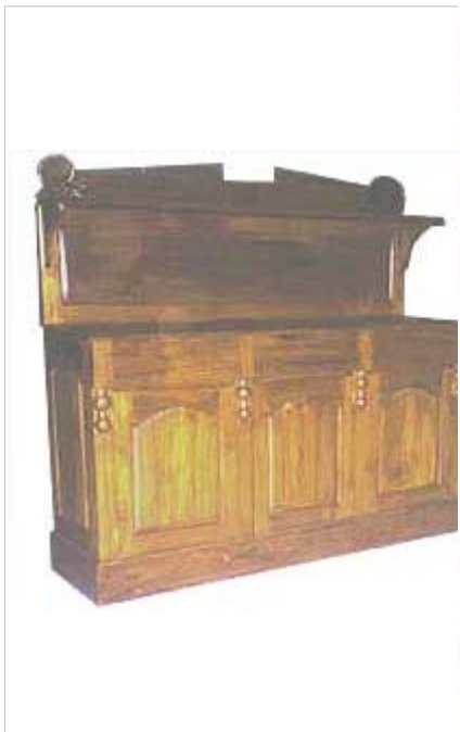
CODE: EB - 355 BUFFET 3 DOORS SIZE: W 165 X D 50 X H 160 (cm)