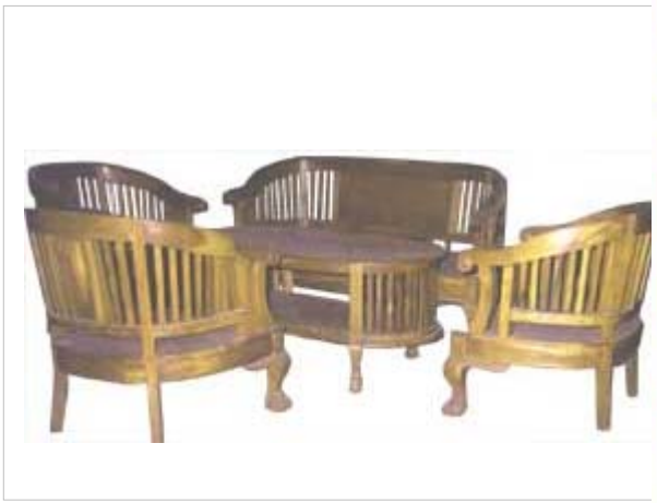
CODE: EB - 415 SOFA TIGER SET SIZE: CHAIR :W 90 X D 67 X H 87 (cm) BENCH : W 165 X D 67 X H 87 (cm) TABLE OVAL: W 125 X D 75 X H 60 (cm)