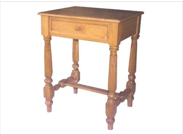
CODE: EB - 430 SIDE TABLE "ULIR" 1 DRAWER SIZE: W 60 X D 50 X H 75 (cm)