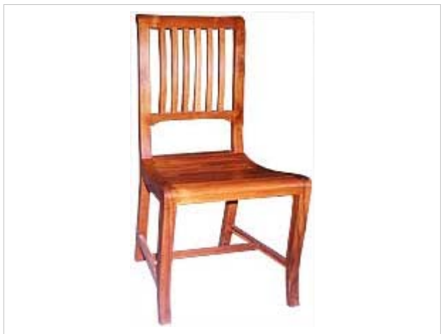
CODE: EB - 424 SLAT BACK DINING CHAIR SIZE: W 50 X D 50 X H 95 (cm)