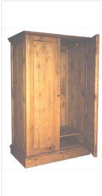
CODE: EB - 346 DRESSER 2 DOORS SIZE: W 105 X D 60 X H 180(cm)