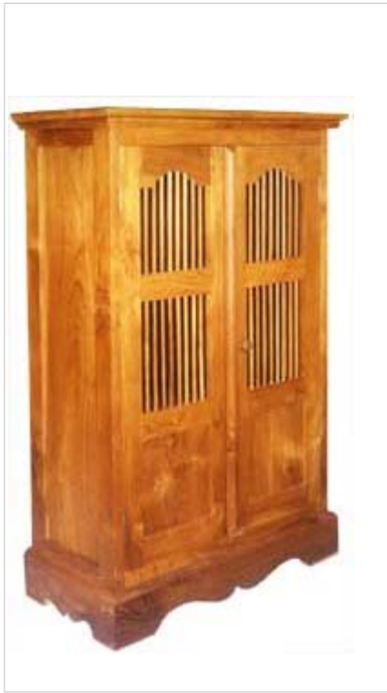
CODE: EB - 363 SMALL CABINET 2 DOORS SIZE: W 80 X D 45 X H 100 (cm)