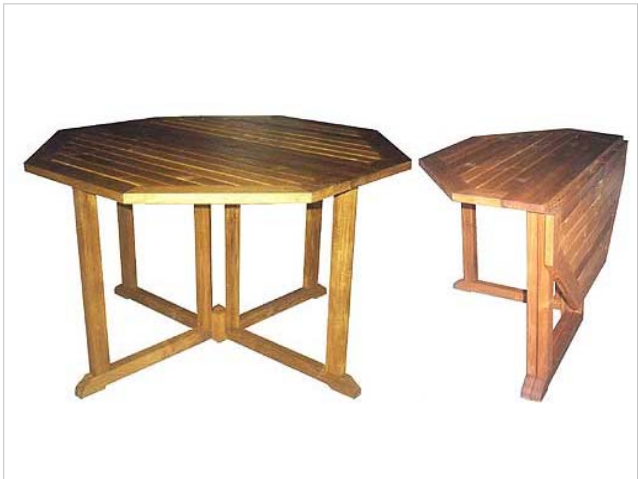
CODE: EB - 317 OCTAGONAL BUTTERFLY TABLE SIZE: Ø 120 X H 75 (cm)