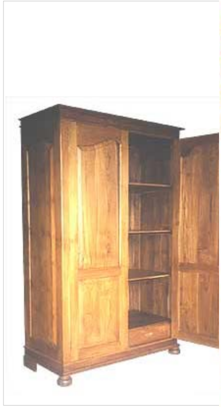
CODE: EB - 343 DRESSER 2 DRAWERS SIZE: W 127 X D 64 X H 202