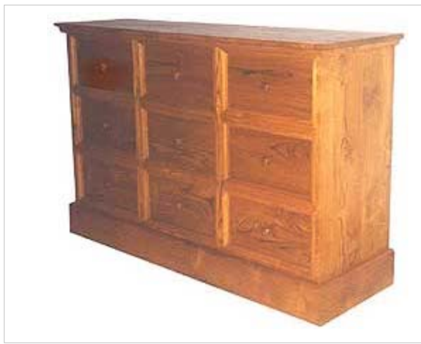
CODE: EB - 361 CABINET 9 DRAWERS PROFILE SIZE: W 150 X D 45 X H 90 (cm)