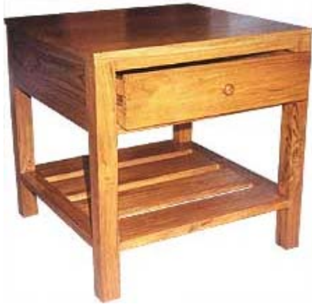
CODE: EB - 396 SIDE TABLE 1 DRAWER WITH RACK SIZE: W 50 X D 50 X H 50 (cm)