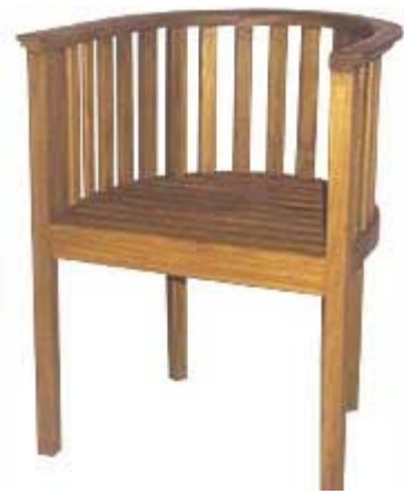
CODE: EB - 388 RADAR CHAIR SIZE: W 60 X D 50 X H 80 (cm)