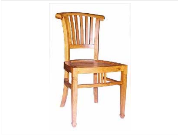
CODE: EB - 422 BANTENG NO ARM CHAIR SIZE: W 50 X D 47 X H 93 (cm)