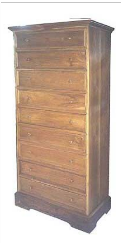
CODE: EB - 308 9 DRAWERS CABINET BIG SIZE: W 70 X D 45X H 180(cm)