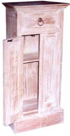
CODE: EB - 374 MEDICINE CAB 2 DOORS 1 DRAWERS SIZE: W 32 X D 22 X H 80 (cm)