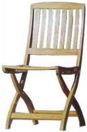
CODE: EB - 416 BARTON FOLDING CHAIR SIZE: W 45 X D 45 X H 90 (cm)