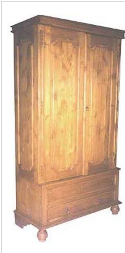
CODE: EB - 348 BIG DRESSER 2 DOORS SIZE: W 135 X D 55 X H 225 (cm)