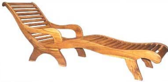
CODE EB - 376 SUNBED LENONG SIZE: W 210 X D 60 X H 70 (cm)