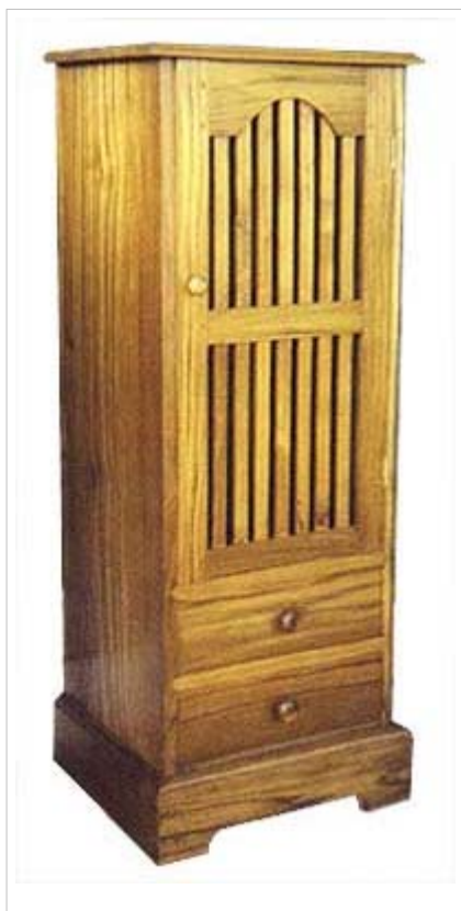
CODE: EB - 309 SMALL CABINET2 DRAWERS SIZE: W 50 X D 40 X H 120 (cm)