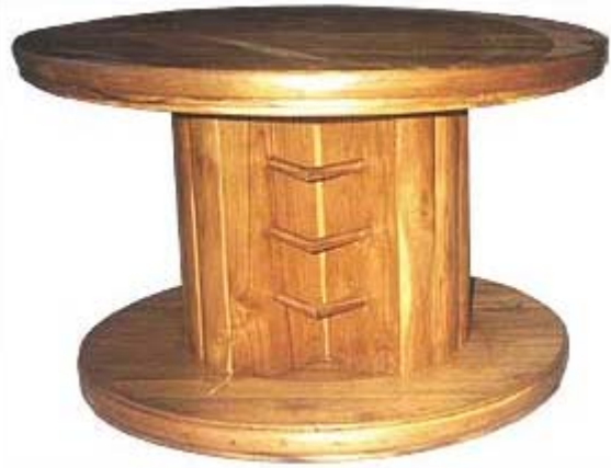
CODE: EB - 395 FLOWER TABLE ROUND SIZE: W 70 X D 70 X H 50 (cm)