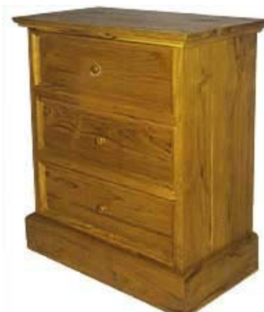
CODE: EB - 371 BED SIDE 3 DOORS PROFILE SIZE: W 60 X D 45 X H 60 (cm)