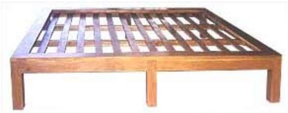
CODE: EB - 382 SIMPLE BED DOUBLE SIZE: W 222 X D 192 X H 42 (cm)