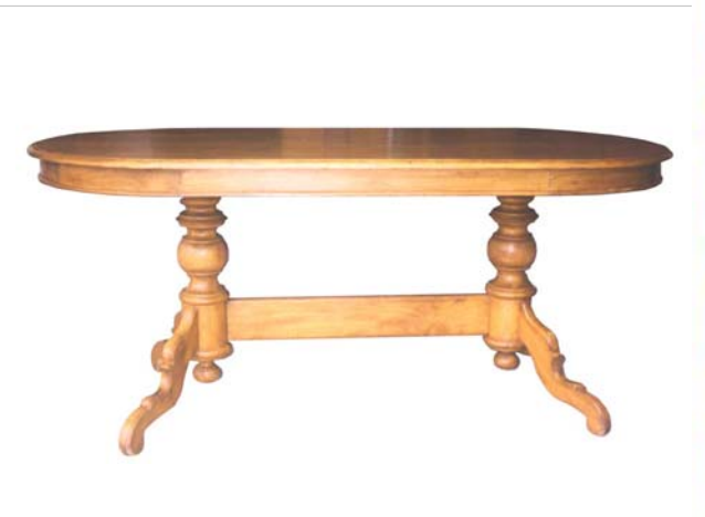
CODE: EB - 433 OVAL "BUBUT" DINING TABLE SIZE: W 180 X D 90 X H 78 (cm)