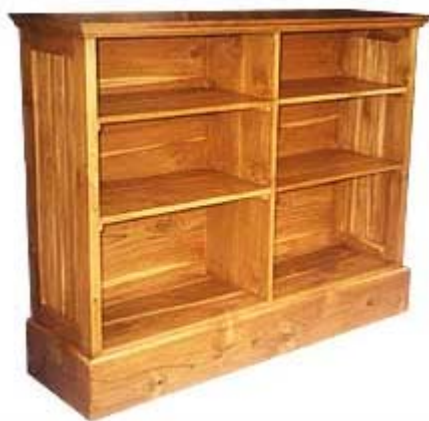
CODE: EB - 400 BOOK CASE SIZE: W 132 X D 38 X H 105 (cm)