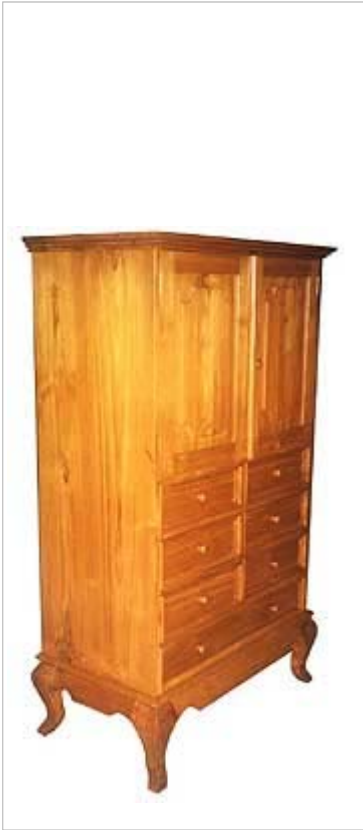
CODE: EB - 341 CABINET LENONG LEGS SIZE: W X D X H (cm)