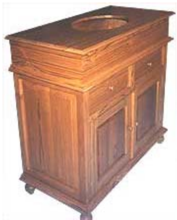
CODE: EB - 368 BASIN CABINET 2 DOORS 2 DRAWERS SIZE: W 100 X D 50 X H 100 (cm)