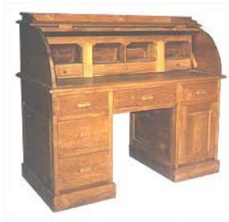
CODE: EB - 357 ROLL TOP HONGKONG SIZE: W 130 X D 67 X H 115 (cm)