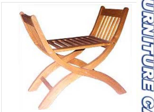
CODE: EB - 425 ROMAN KNOCK DOWN CHAIR SIZE: W 78 X D 38 X H 60 (cm)