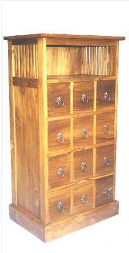
CODE: EB - 351 CD CABINET 12 DRAWERS SIZE: W 58X D 37 X H 107 (cm)