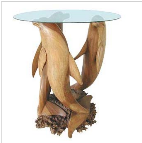
CODE: EB - 343DT TALL DOLPHIN TABLE SIZE: W X D X H (cm)

FOR MORE CARVED TABLE EXAMPLES VISIT www.exbali.com