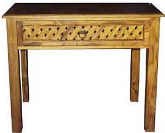
CODE: EB - 399 SIDE TABLE 1 DRAWER SIZE: W 80 X D 50 X H 65 (cm)