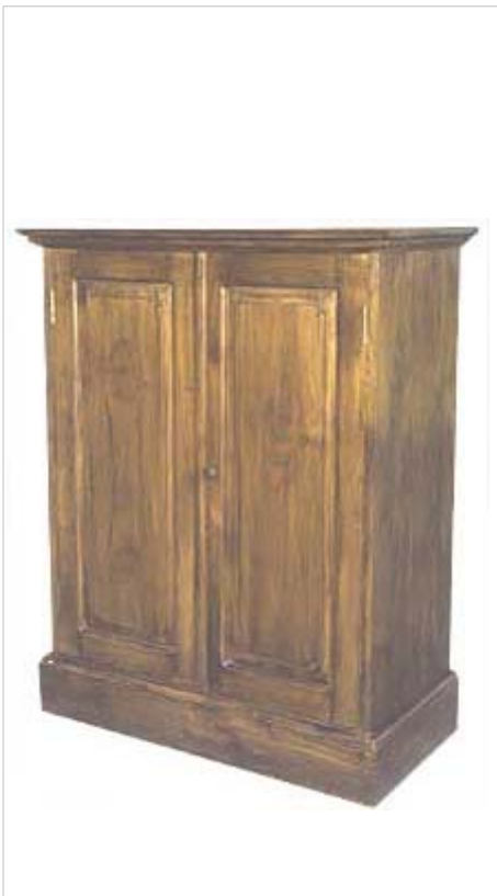
CODE: EB - 366 SM CABINET 2 DOORS SIZE: W 80 X D 40 X H 100 (cm)