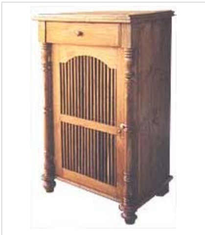
CODE: EB - 314 CABINET 1 DRAWER SMALL SIZE: W 60 X D 40 X H 105 (cm)