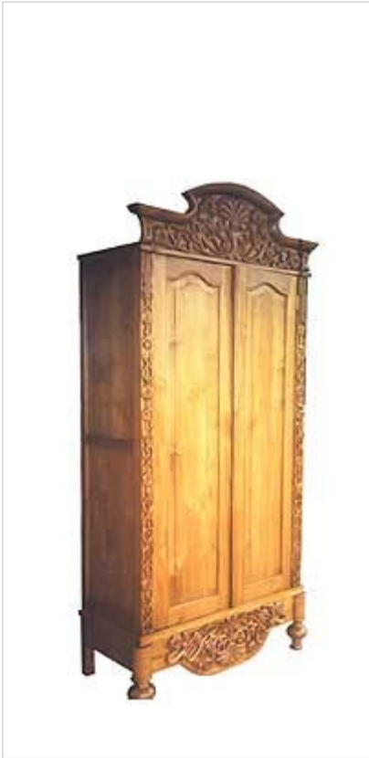
CODE: EB - 342 DRESSER WITH CARVING SIZE: W X D X H (cm)