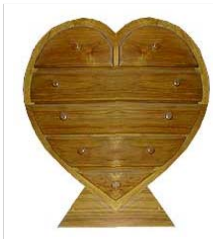
CODE: EB - 340H HEART CABINET SIZE: W 100 X D 30 X H 110 (cm)