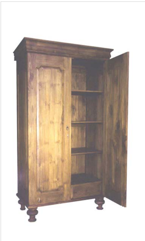
CODE: EB - 347 DRESSER 2 DOORS SIZE: W 132 X D 60 X H 203 (cm)