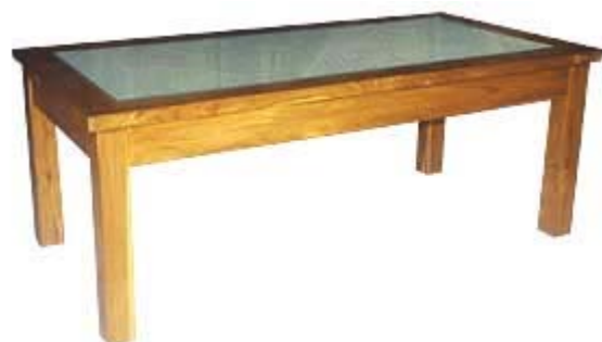
CODE: EB - 337 COFFEE TABLE WITH GLASS SIZE: W 120 X D 60 X H 50 (cm)