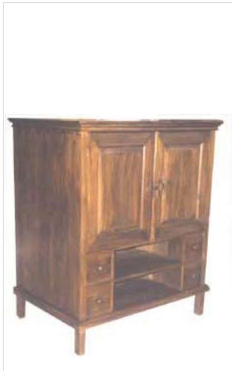
CODE: EB - 339 TV CABINET 4 DRAWERS SIZE: W 103 X D 68 X H 121 (cm)