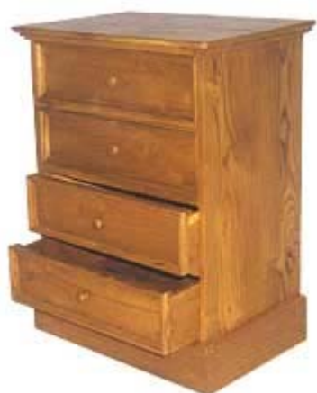
CODE: EB - 372 BED SIDE 4 DOORS PROFILE SIZE: W 60 X D 45 X H 80 (cm)