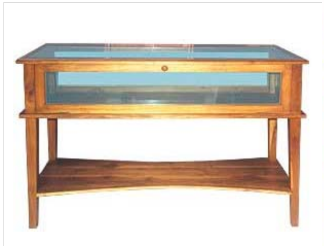
CODE: EB - 331 GLASS SIDE TABLE SIZE: W 120 X D 40 X H 75 (cm)