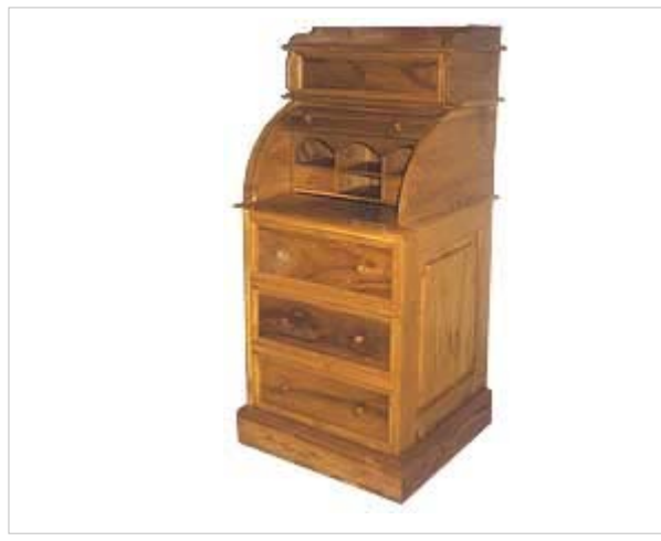
CODE: EB - 359 SMALL ROLL TOP SIZE: W 54 X D 63 X H 120 (cm)