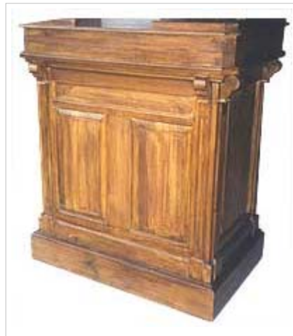
CODE: EB - 313 PODIUM SIZE: W X D X H (cm)