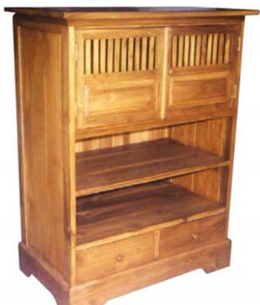
CODE: EB - 392 SMALL CABINET 2 DOORS 2 DRAWERS SIZE: W 76 X D 43 X H 100 (cm)