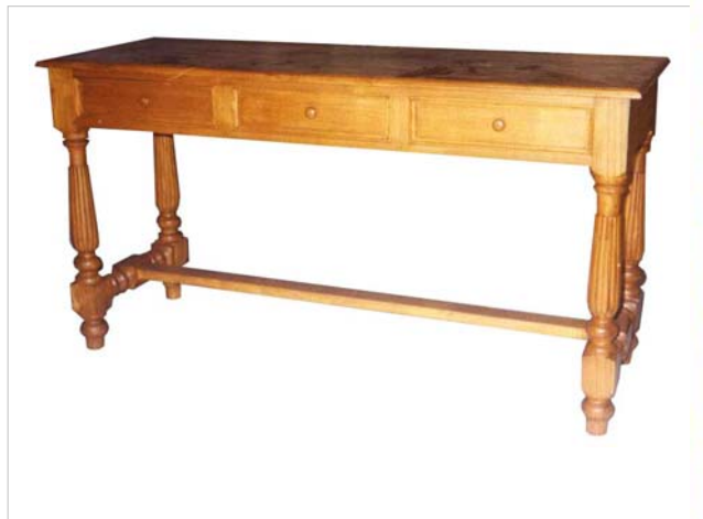
CODE: EB - 431 SIDE TABLE "ULIR" 3 DRAWERS SIZE: W 140 X D 50 X H 75 (cm)