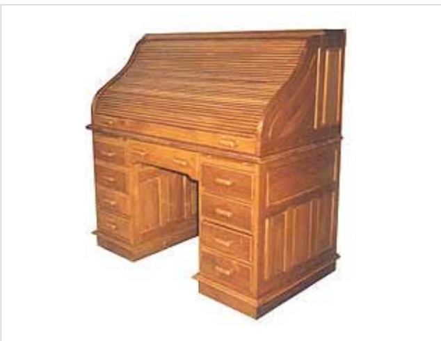
CODE: EB - 358 ROLL TOP AMERICA SIZE: W 135 X D 68 X H 115 (cm)