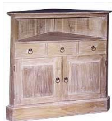
CODE: EB - 393 CORNER TABLE 2 DOORS 3 DRAWERS SIZE: W 93 X D 51 X H 100 (cm)