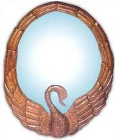
CODE: EB - 380 SWAN FRAME + MIRROR SIZE: W 85 X D 7 X H 90 (cm)