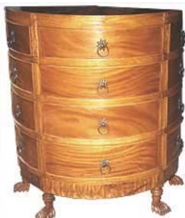
CODE: EB - 369 CONSOLE TABLE 12 DRAWERS SIZE: W 67 X D 33 X H 75 (cm)