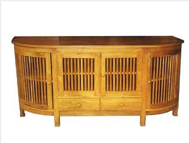
CODE: EB - 356 BUFFET OVAL 4 DOORS 2 DRAWERS SIZE: W X D X H (cm)