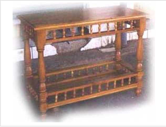
CODE: EB - 145 SIDE TABLE BOTTOM RACK SIZE: W 100 x D 45 x H 75