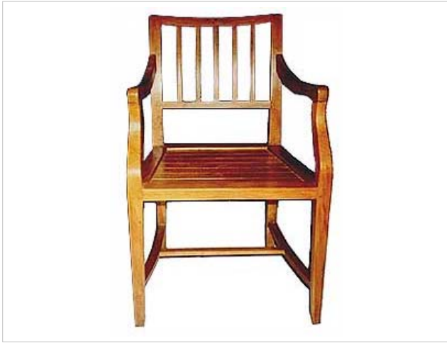
CODE: EB -021 ARM DINING CHAIR SIZE: W 55 x D 50 x H 90 (cm)