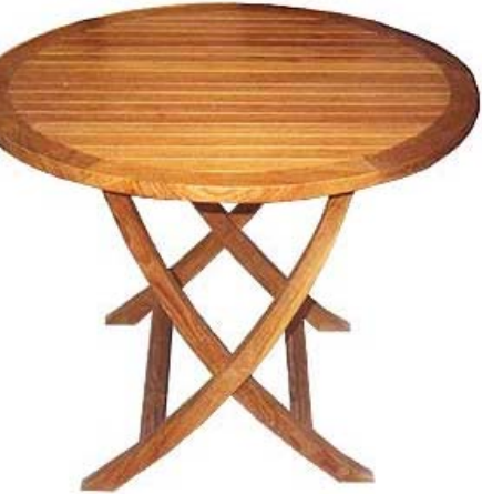
CODE: EB - 102 ROUND FOLDING TABLE SIZE: Ø 100 x H 75 (cm)