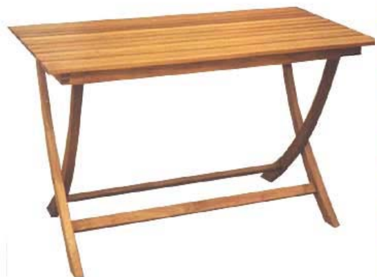
CODE: EB -106 GARDEN "JARI-JARI" TABLE SIZE: W 120 x D 70 x H 75 (cm)