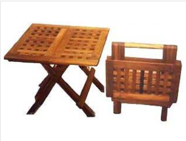
CODE: EB -120 PICNIC TABLE SIZE: W 60 x D 50 x H 50 (cm)