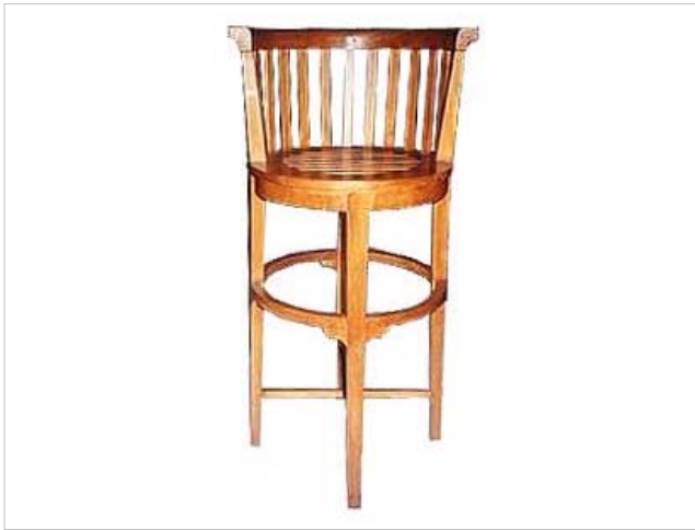
CODE: EB -017 BAR STOOL BASKET CHAIR SIZE: W 50 x D 55 x H 115 (cm)