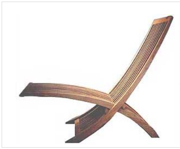
CODE: EB - 045 LAZY CHAIR "CACING" SIZE: W 45 x D 70 x H 120 (cm)