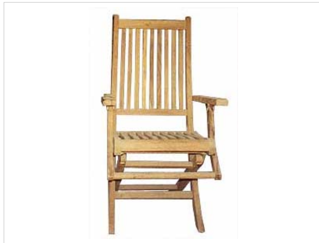
CODE: EB - 057 BRASS FOLDING CHAIR PETRUK SIZE: W 60 x D 50 x H 105 (cm)