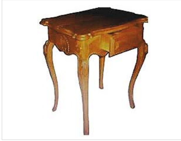
CODE: EB - 146 LENONG TABLE 1 DRAW SIZE: W 65 x D 52 x H 76 (cm)