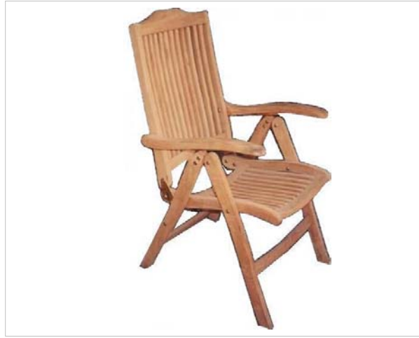
CODE: EB - 062 SLUMBER CHAIR A SIZE: W 60 x D 60 x H 110 (cm)