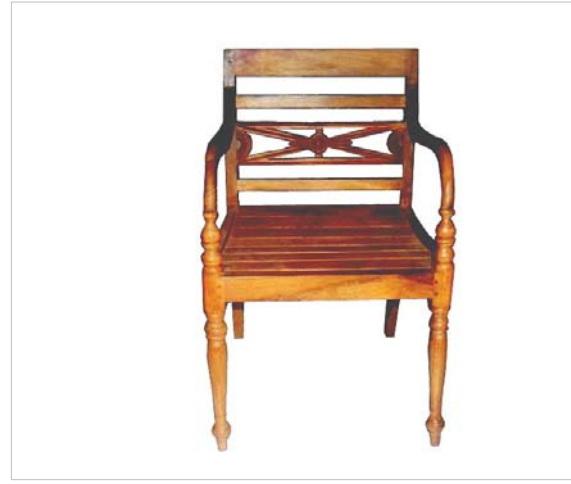
CODE: EB -022 BATAVIA CHAIR A SIZE: W 54 x D 55 x H 84 (cm)