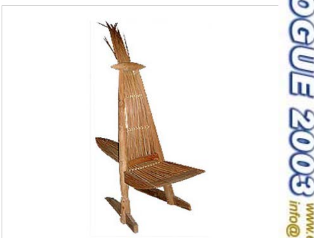
CODE: EB -020 LIDI CHAIR SIZE: W 60 x D 80 x H 140 (cm)