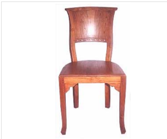
CODE: EB -010B ITALIAN WOODEN CHAIR SIZE: W 50 x D 45 x H 90 (cm)