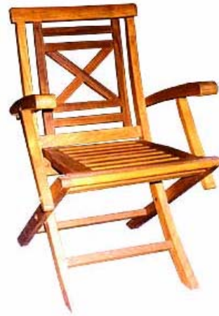
CODE: EB - 050C HAMPTON ARM CROSS CHAIR SIZE: W 55 x D 54 x H 87 (cm)