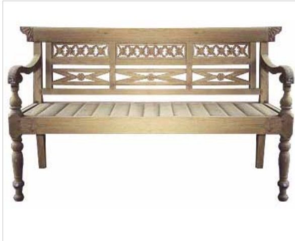
CODE: EB - 073 TASMANIA BENCH SIZE: W 180.142 x D 55 x H 92 (cm)