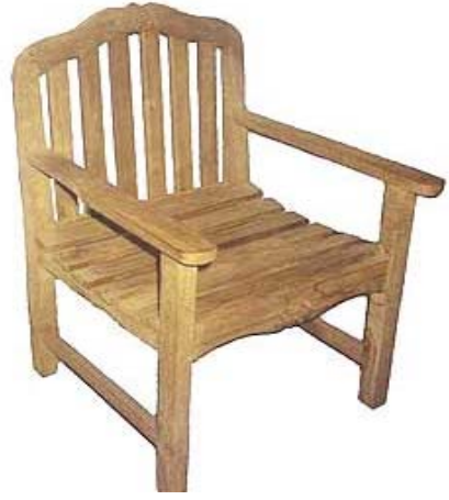
CODE: EB - 033 GARDEN CHAIR ROSE SIZE: W 53 x D 50 x H 92 (cm)