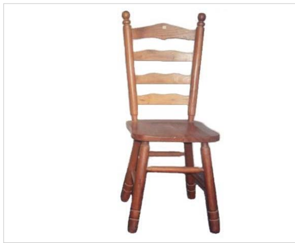
CODE: EB -005 DINING CHAIR A SIZE: W 45 x D 45 x H 105 (cm)