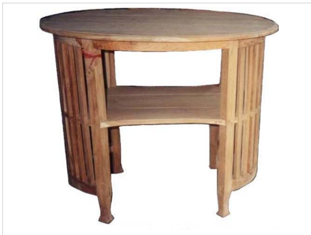
CODE: EB - 131 OVAL "RACAK" TABLE SIZE: W 90 x D 65 x H 75 (cm)