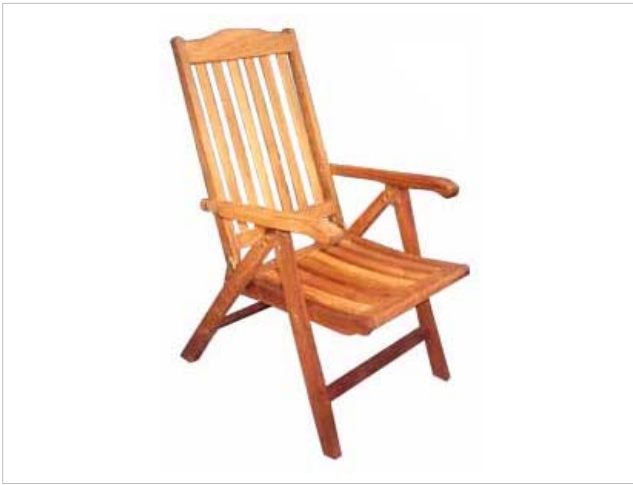
CODE: EB - 063 SLUMBER CHAIR C SIZE: W 65 x D 60 x H 110 (cm)