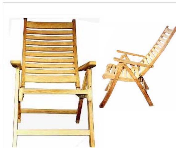
CODE: EB - 060 DORSET CHAIR A SIZE: W 65 x D 60 x H 110 (cm)