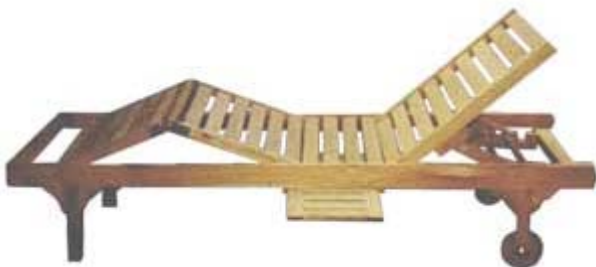
CODE: EB - 088 SUN BED FOLDING 3 WITH TRAY SIZE: W 200 x D 70 x H 45 (cm)