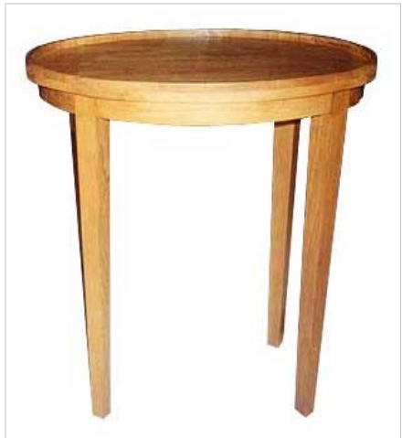
CODE: EB - 128 OVAL TEA TABLE BIG SIZE: W 105 x D 65 x H 75 (cm)