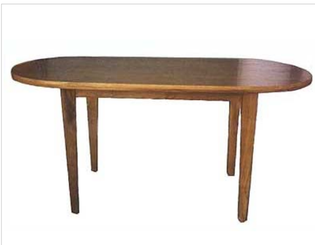
CODE: EB - 150 OVAL DINING TABLE SIZE: W 180 x D 90 x H 75 (cm)