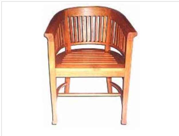
CODE EB -024B U PRESS "RACAK" CHAIR SIZE: W 60 x D 55 x H 85 (cm)