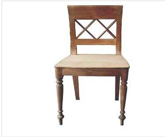
CODE: EB -007 DOUBLE CROSS BACK CHAIR SIZE: W 45 x D 50 x H 85 (cm)