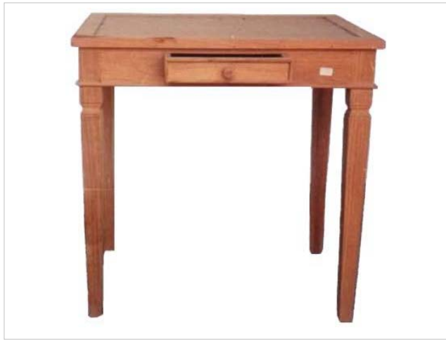
CODE: EB - 139 SIDE TABLE WITH DRAW SIZE: W 95 x D 50 x H 75 (cm)