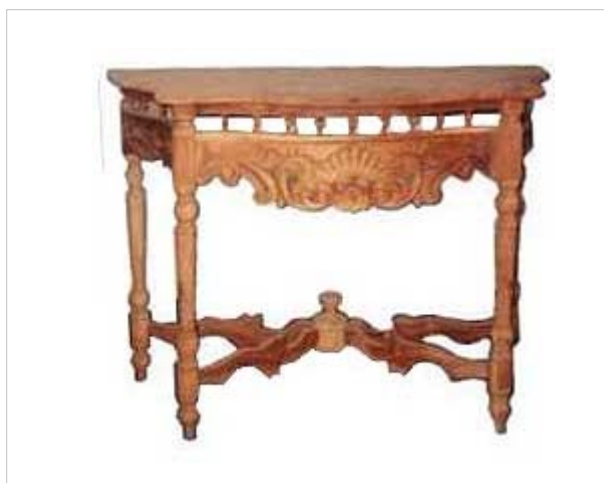
CODE: EB - 136 CONSUL TABLE CARVED SIZE: W 90 x D 40 x H 75 (cm)