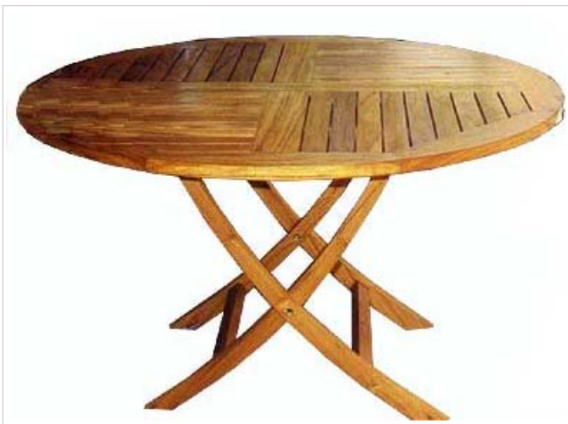
CODE: EB -107 ROUND FOLDING TABLE B SIZE: Ø 120 x H 75 (cm)