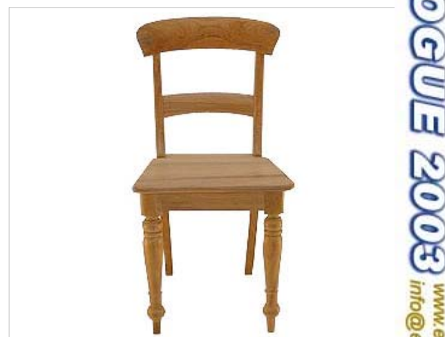
CODE: EB -016 DINING BUBUT CHAIR SIZE: W 50 x D 50 x H 90 (cm)