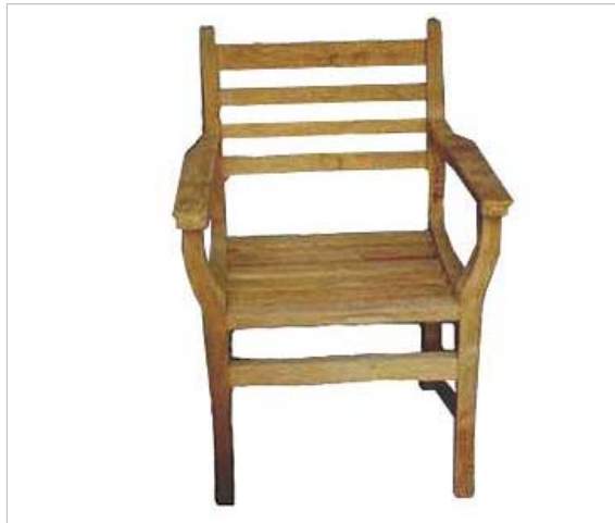
CODE: EB - 039 GARDEN CHAIR SMALL SIZE: W 60 x D 57 x H 86 (cm)