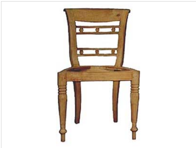
CODE: EB -008 RAFFLES TANDUK CHAIR SIZE: W 45 x D 50 x H 85 (cm)