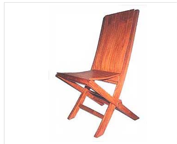
CODE: EB - 049 FOLDING CHAIR "LENGKUNG"/NEW SIZE: W 50 x D 55 x H 103 (cm)