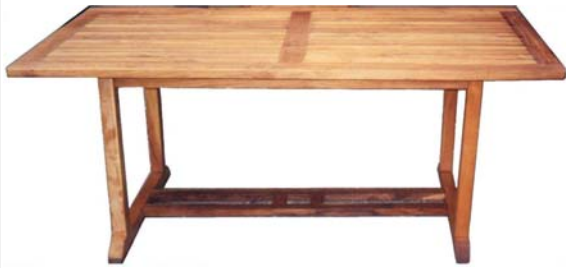
CODE: EB -101 RECTANGULAR TABLE SIZE: W 180,150 x D 90,80 x H 75 (cm)