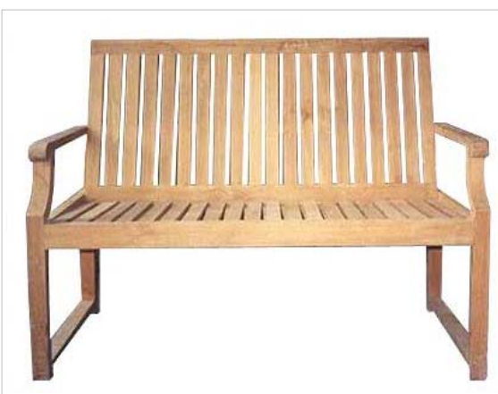
CODE: EB - 071 AMERICAN BENCH SIZE: W 130 x D 70 x H 94 95 (cm)