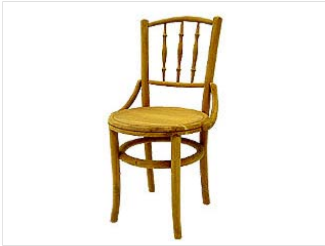
CODE: EB -006 SLAT DINING CHAIR SIZE: W 46 x D 42 x H 87 (cm)