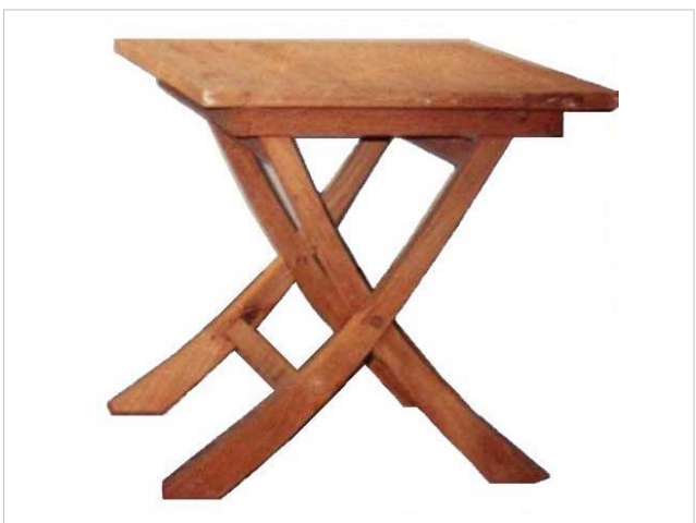
CODE: EB -109 SQUARE FOLDING TABLE SMALL SIZE: W 50 x D 50 x H 45 (cm)