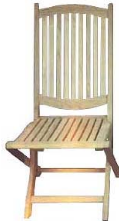
CODE: EB - 052 OVAL FOLDING CHAIR SIZE: W 44 x D 63 x H 90 (cm)