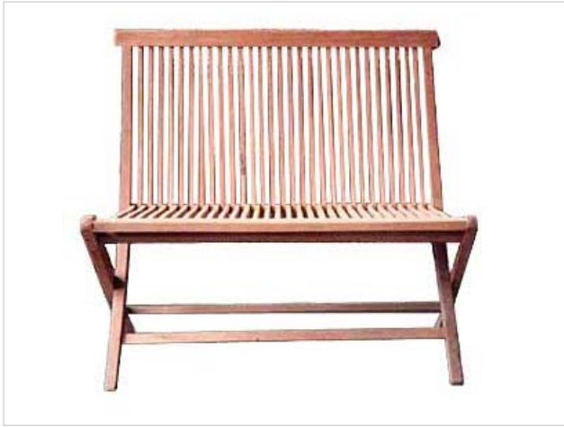
CODE: EB - 078 FOLDING BENCH SIZE: W 100 x D 45 x H 90 (cm)