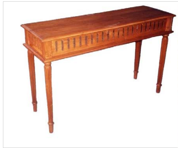
CODE: EB -140 SIDE TABLE CAPSUL LARGE SIZE: W 120 x D 40 x H 75 (cm)