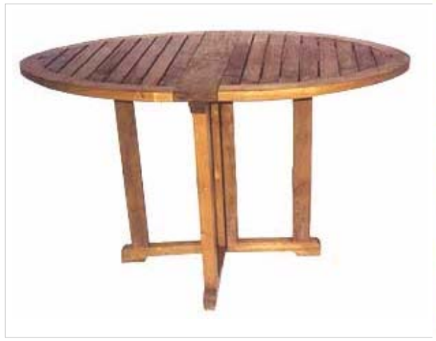
CODE: EB - 099A OVAL BUTTERFLY TABLE SIZE: W 130 x D 70 x H 75 (cm)