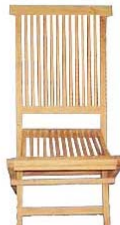
CODE: EB - 054 BRASS FOLDING CHAIR BIG SIZE: x D x H (cm)