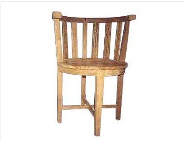
CODE: EB -003 BASKET CHAIR SIZE: W 48 x D 48 x H 80 (cm)