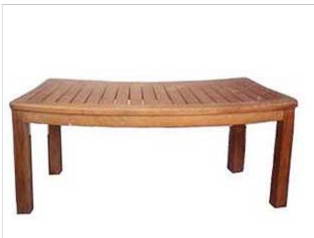
CODE: EB - 137 CORNER COFFEE TABLE SIZE: W x D x H (cm)