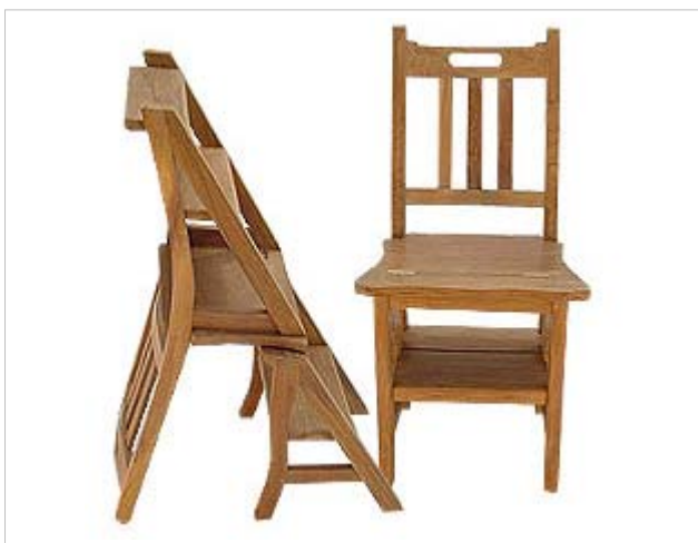
CODE: EB -015 LIBRARY STEP CHAIR SIZE: W 45 x D 45 x H 90 (cm)