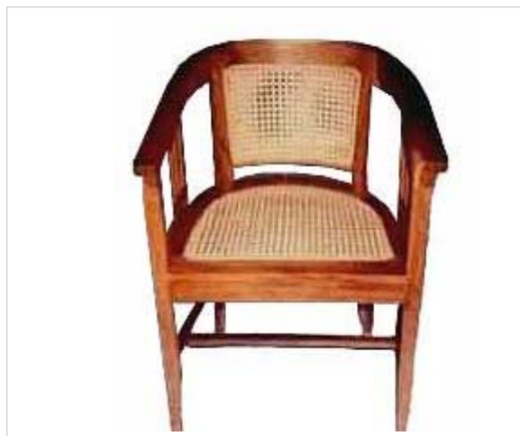
CODE: EB -004 U.PRESS RATTAN CHAIR SIZE: W 60 x D 55 x H 85 (cm)