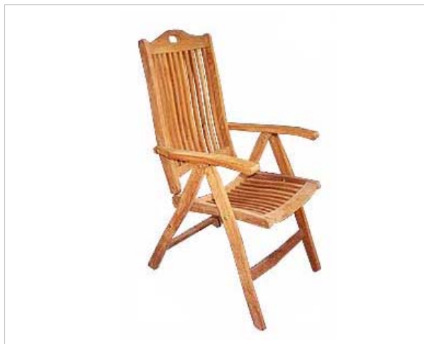
CODE: EB - 064 SLUMBER CHAIR B SIZE: W 60 x D 60 x H 110 (cm)