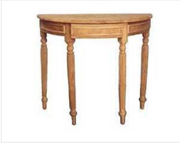
CODE: EB -134 CONSUL TABLE WITH DRAW SIZE: W 85 x D 45 x H 75 (cm)