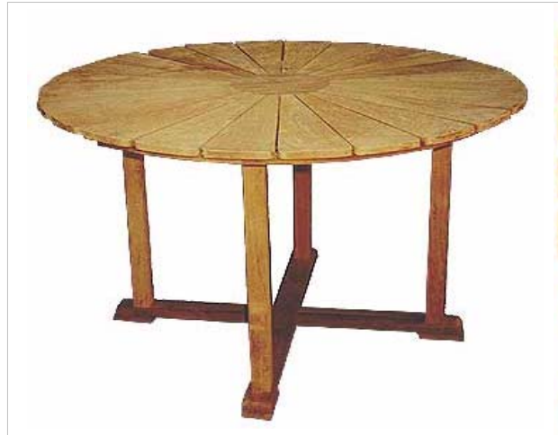
CODE: EB - 097 SUN FLOWER TABLE SIZE: Ø120 x H 75 (cm)