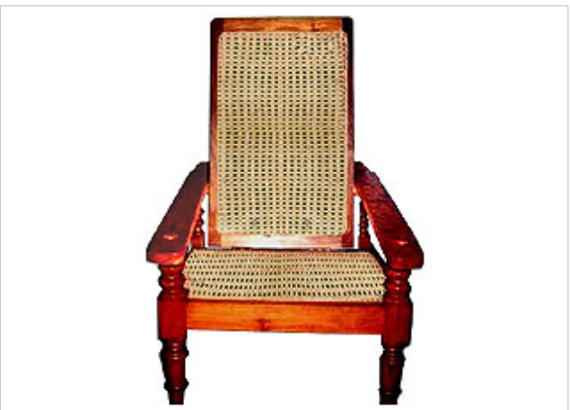
CODE: EB 030 RATTAN CHAIR BIG SIZE: W x D x H cm