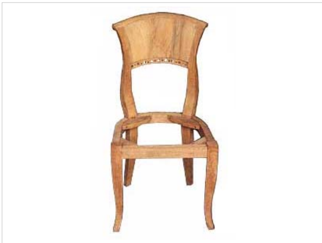
CODE: EB -010 ITALIAN CHAIR SIZE: W 50 x D 45 x H 90 (cm)