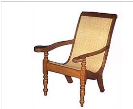
CODE: EB - 031 LAZY RATTAN CHAIR OPEN ARM SIZE: W 70 x D 115 x H 105 (cm)