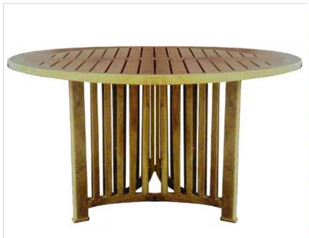
CODE: EB - 100 MERCY TABLE SIZE: Ø 80,90,100,120 x H 75 (cm)