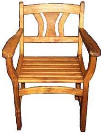
CODE: EB - 034 GARDEN CHAIR TULIP SIZE: W 60 x D 57 x H 86 (cm)