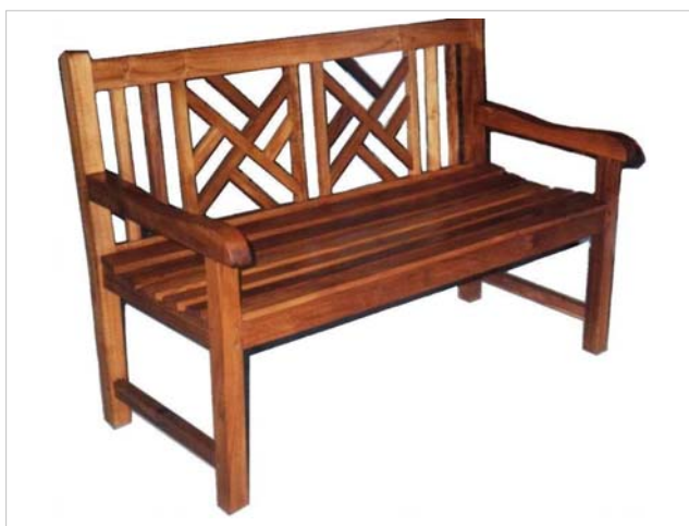
CODE: EB - 069 A CHIPPENDALE BENCH A SIZE: W 120,150,180 x D 50 x H 90 (cm)