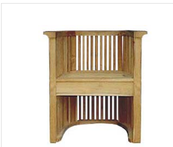
CODE: EB - 043 BAUHAUS CHAIR SIZE: W 69 x D 52 x H 80 (cm)