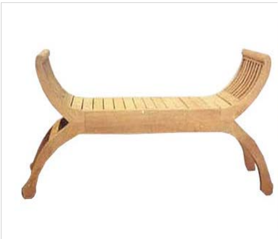
CODE: EB - 081 ROMAN WOODEN CHAIR LARGE B SIZE: W 130,85 x D 35 x H 60 (cm)