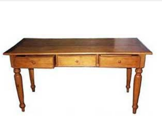
CODE: EB - 149 SIDE TABLE 3 DRAWS SIZE: W 150 x D 50 x H 75 (cm)