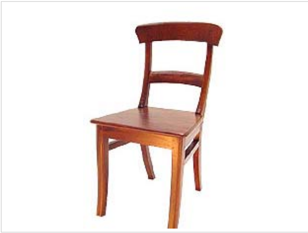
CODE: EB -011 DINING CHAIR B SIZE: W 50 x D 50 x H 90 (cm)