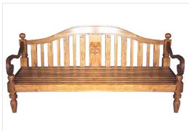
CODE: EB - 070 BIG BENCH SIZE: W 200 x D 80 x H 91 (cm)