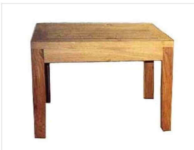
CODE: EB -110 STAND LEG TABLE SMALL SIZE: W 60 x D 60 x H 55 (cm)