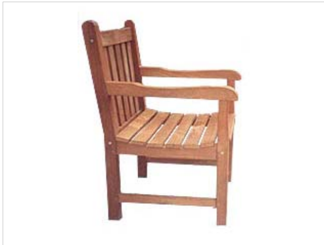
CODE: EB - 038 PICADILLY CHAIR SIZE: W 57 x D 65 x H 92 (cm)