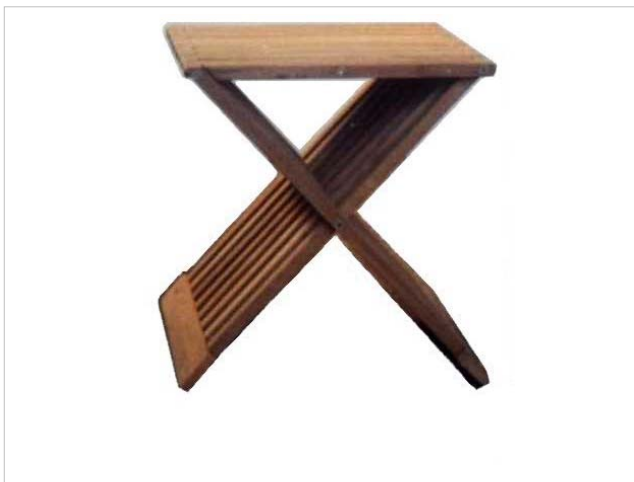
CODE: EB - 113 RECAL TABLE SMALL SIZE: W 40 x D 32 x H 43 (cm)