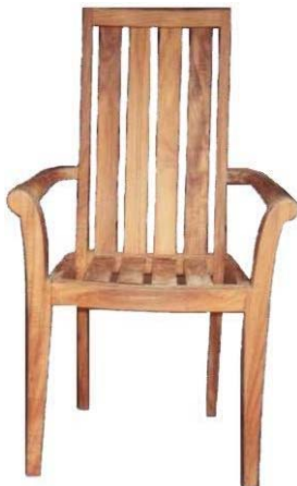
CODE: EB - 036 STACKING CHAIR HIGH BACK SIZE: W 65 x D 50 x H 105 (cm)