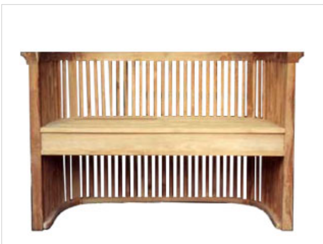
CODE: EB - 042 BAUHAUS BENCH SIZE: W 125 x D 50 x H 80 (cm)