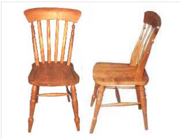
CODE: EB -013 SLAT CHAIR SIZE: W 50 x D 50 x H 90 (cm)