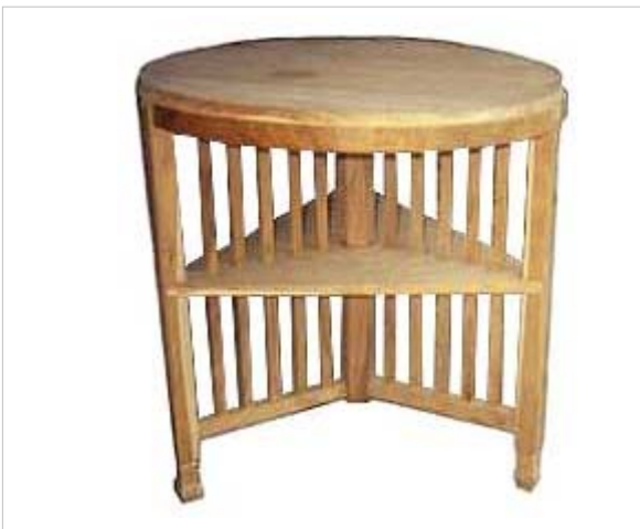
CODE: EB - 132 ROUND RACAK TABLE SIZE: W 75 x D 75 x H 75 (cm)