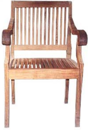
CODE: EB - 032 BAR STOOL GARDEN CHAIR SIZE : W 53 x D 50 x H 90 (cm)