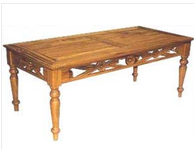
CODE: EB - 125 BATAVIA COFFEE TABLE SIZE: W 130 x D 63 x H 50 (cm)