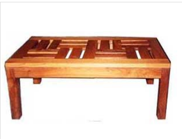
CODE: EB - 122 PATRICIA COFFEE TABLE SIZE: W 100 x D 50 x H 50 (cm)