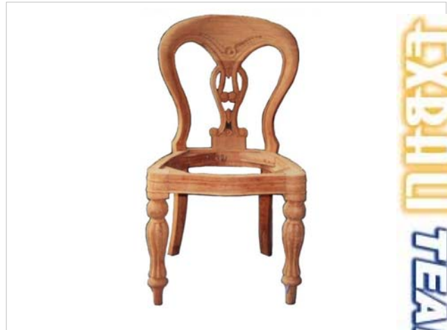
CODE: EB-012 DAT CHAIR SIZE: W 50 x D 50 x H 95 (cm)