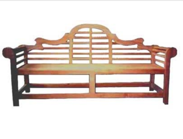
CODE: EB - 072 MARLBORO BENCH SIZE: W 130.150.180.200 x D 55 x H 90 (cm)