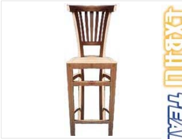
CODE: EB -018 BAR STOOL BABY CHAIR SIZE: W 40 x D 40 x H 110 (cm)