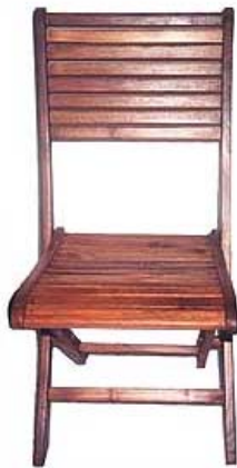
CODE: EB - 51 BRASS FOLDING CHAIR SMALL SIZE: W 45 x D 50 x H 90 (cm)