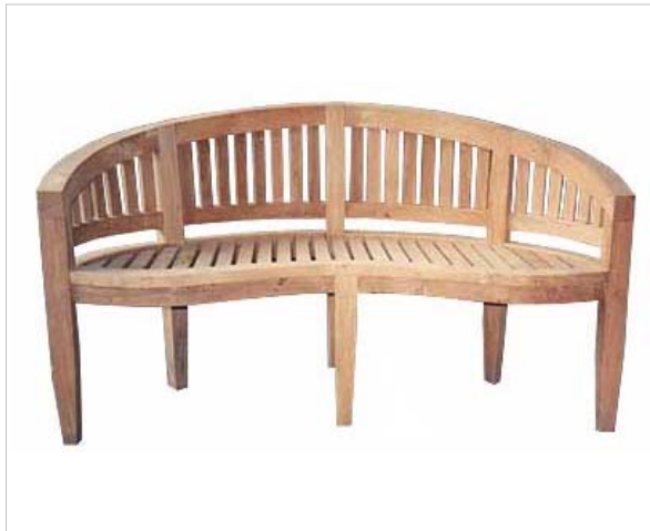
CODE: EB - 075 CORNER BENCH SIZE: W 150 x D 70 x H 90 (cm)