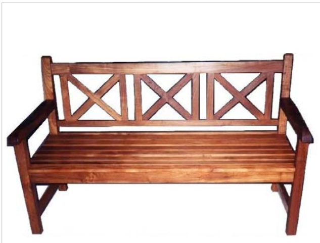
CODE: EB - 067 CROSS BACK GARDEN BENCH SIZE: W 120,150,180 x D 50 x H 90 (cm)