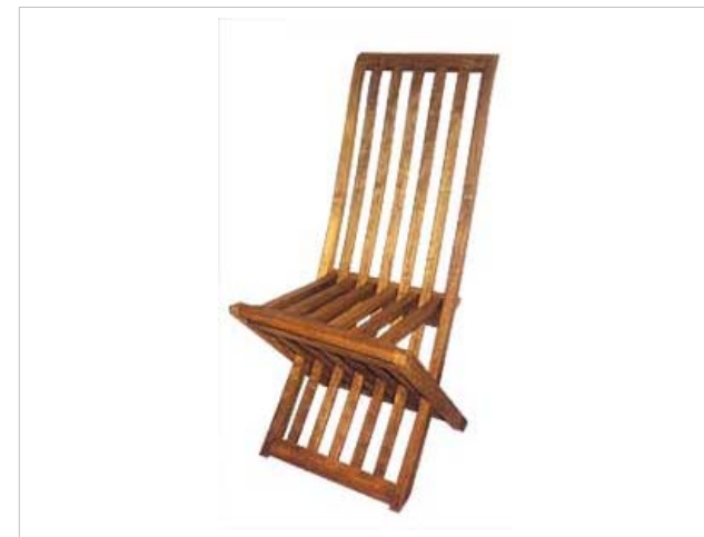
CODE: EB - 048 FOLDING CHAIR BIG SIZE: W 54 x D 55 x H 115 (cm)