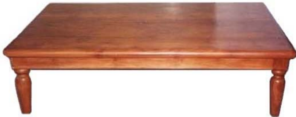
CODE: EB - 086 BIG COFFEE TABLE SIZE: W 200 x D 200 x H 40 (cm)