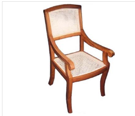
CODE: EB - 029 RATTAN CHAIR A SIZE: W 54 x D 50 x H 100 (cm)