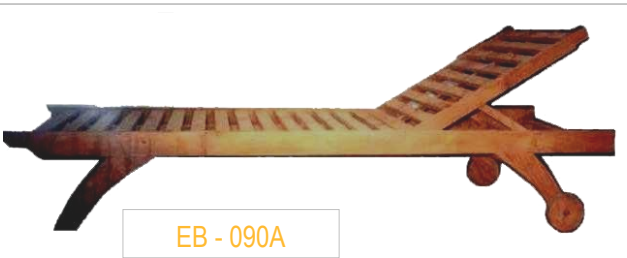
EB - 090A