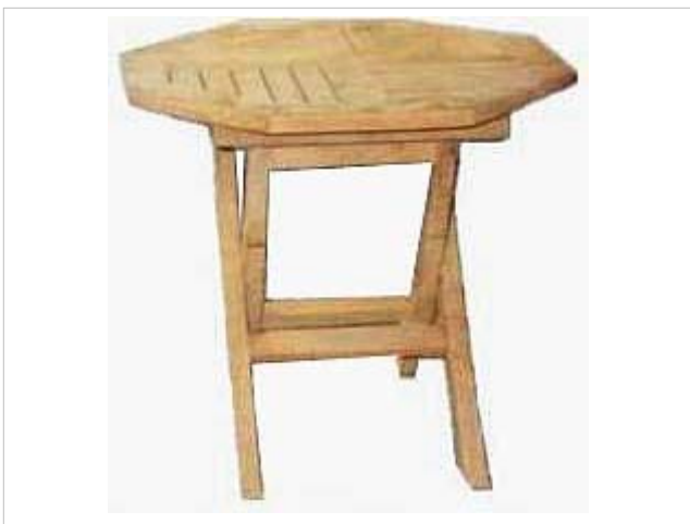
CODE: EB - 115 OCTAGONAL TABLE SMALL SIZE : W 50 x D 50 x H 45 (cm)