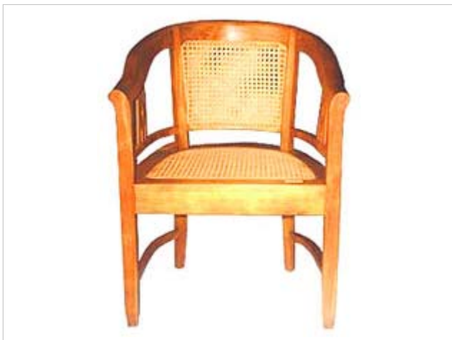
CODE: EB -004 U.PRESS RATTAN CHAIR SIZE: W 60 x D 55 x H 85 (cm)