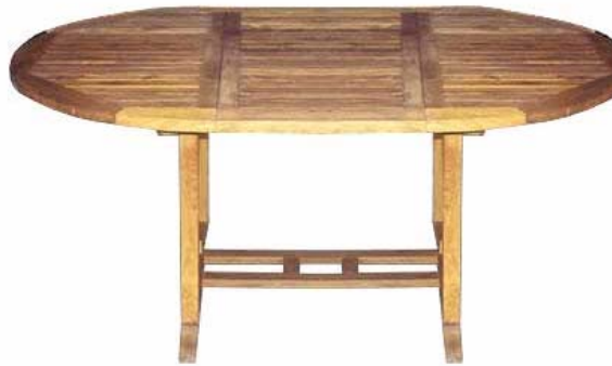
CODE: EB - 091 ROUND EXTENSION TABLE SIZE: W 170/120 x D 120 x H 75 (cm)