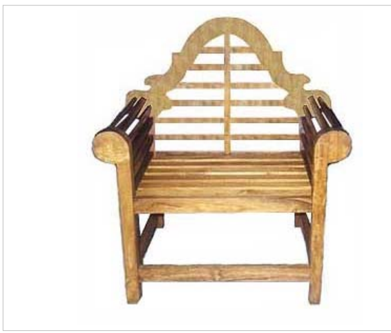
CODE: EB - 041 MARLBORO CHAIR SIZE: W 95 x D 55 x H 105 (cm)