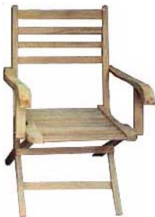
CODE: EB - 053 LINDA CHAIR WITH ARM SMALL SIZE: W x D 45 x H 90 (cm)