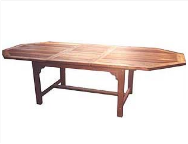
CODE: EB - 096 OCTAGONAL EXTENSION TABLE B SIZE: W 280 / 240 x D 120 x H 75 (cm)