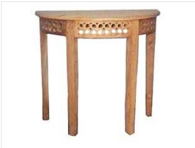
CODE: EB - 135 CONSUL TABLE "KRAWANG" SIZE: W 85 x D 45 x H 75 (cm)