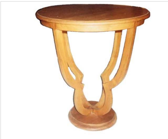
CODE: EB - 127 ROUND TABLE "LENGKUNG" SIZE: W 80 x D 80 x H 75 (cm)