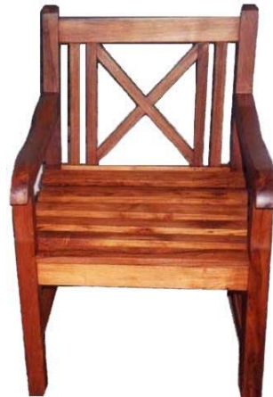
CODE: EB - 037 CROSS BACK GARDEN CHAIR SIZE: W 57 x D 65 x H 92 (cm)