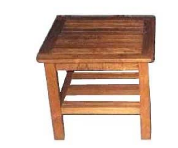
CODE: EB -119 SQUARE TABLE WITH RACK SMALL SIZE: W 50 x D 50 x H 50 (cm)