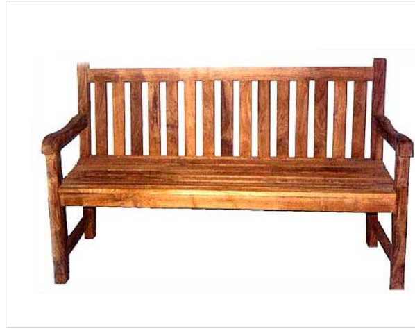
CODE: EB - 066 PICADILLY BENCH SIZE: W 120,150,180 x D 60 x H 95 (cm)