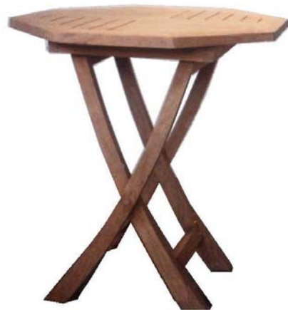
CODE: EB -104 OCTAGONAL FOLDING TABLE B SIZE: W 70 x D 70 X H 75 (cm)