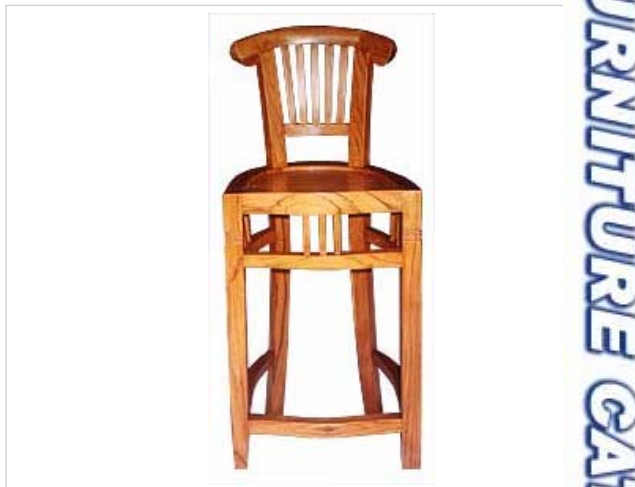
CODE: EB -018C BAR STOOL "TANDUK" CHAIR SIZE: W 40 x D 40 x H 106 (cm)