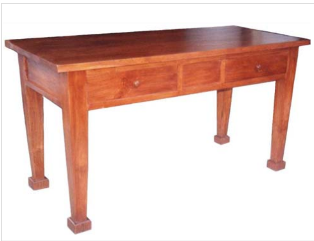
CODE: EB - 098 OFFICE TABLE 2 DRAWS SIZE: W 150 x D 80 x H 75 (cm)