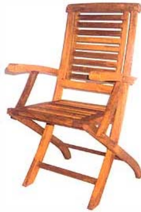
CODE: EB - 050B HAMPTON ARM CHAIR SIZE: W 55 x D 54 x H 87 (cm)