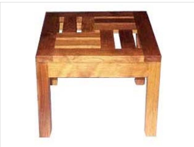
CODE: EB -124 PATRICIA TABLE SMALL SIZE: W 50 x D 50 x H 50 (cm)