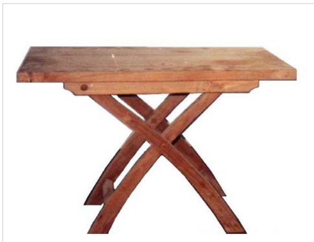
CODE: EB -108 FOLDING TABLE MEDIUM SIZE: W 75 x D 50 x H 50 (cm)