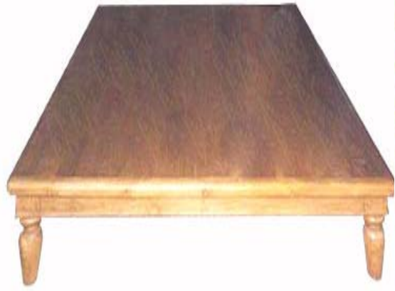
CODE: EB - 085 WOODEN BED SIZE: W 200 x D 150 x H 25 (cm)