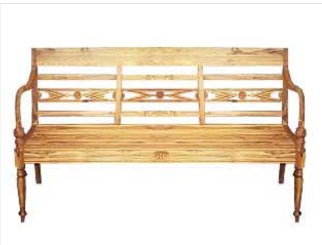
CODE: EB - 076 BATAVIA BENCH 3 SEAT SIZE: W 155 x D 50 x H 90 (cm)