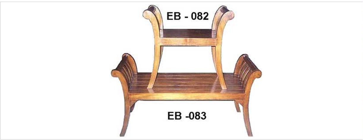
CODE: EB - 082 ROMAN WOODEN CHAIR SIZE: W 65 x D 35 x H 65 (cm)