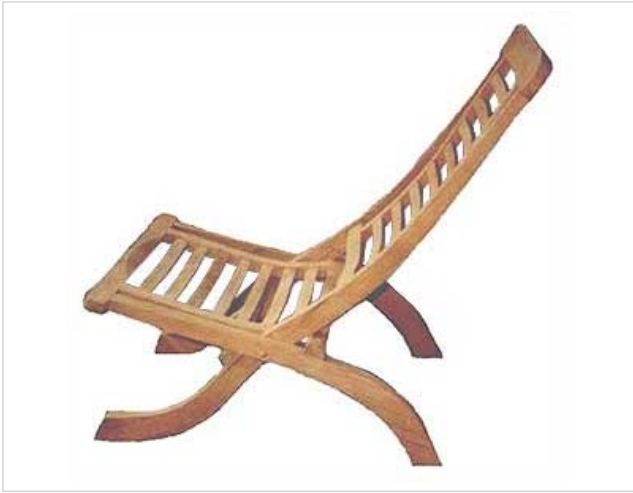
CODE: EB - 044 GARDEN LAZY CHAIR SMALL SIZE: W 50 x D 95 x H 80 (cm)