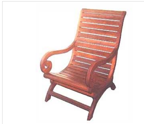
CODE: EB - 027 LAZY WOODEN CHAIR BIG SIZE: W 65 x D 100 x H 105 (cm)