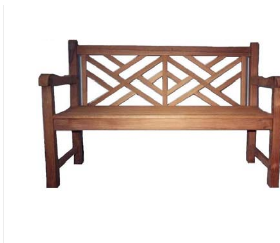
CODE: EB-069 B CHIPPENDALE BENCH B SIZE: W 120, 150, 180 x D 50 x H 90 (cm)