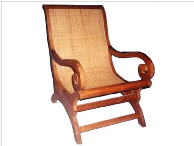
CODE: EB - 028 LAZY RATTAN CHAIR BIG SIZE: W 65 x D 100 x H 105 (cm)