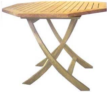
CODE: EB - 103 OCTAGONAL FOLDING TABLE A SIZE: W 100 x D 100 x H 75 (cm)