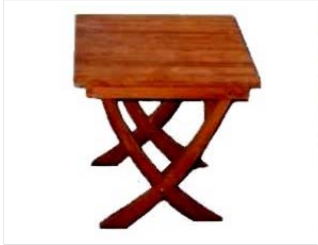
CODE: EB - 121 SQUARE TABLE "JARI - JARI " SMALL SIZE: W 50 x D 50 x H 45 (cm)