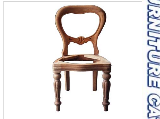
CODE: EB -014 DAT GRAPPE CHAIR SIZE: W 50 x D 50 x H 95 (cm)