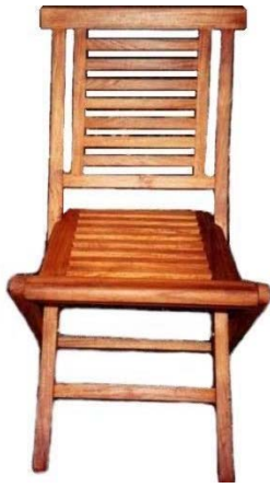
CODE: EB - 050 HAMPTON CHAIR SIZE: W 50 x D 50 x H 87