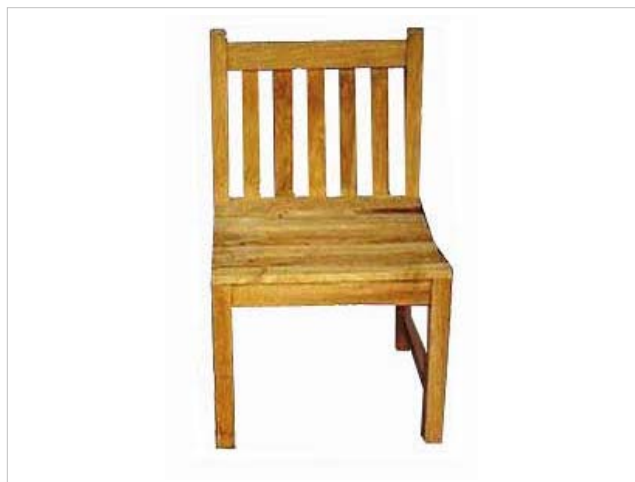
CODE: EB - 040 PICADILLY CHAIR W/O ARM SIZE: W 45 x D 45 x H 92 (cm)