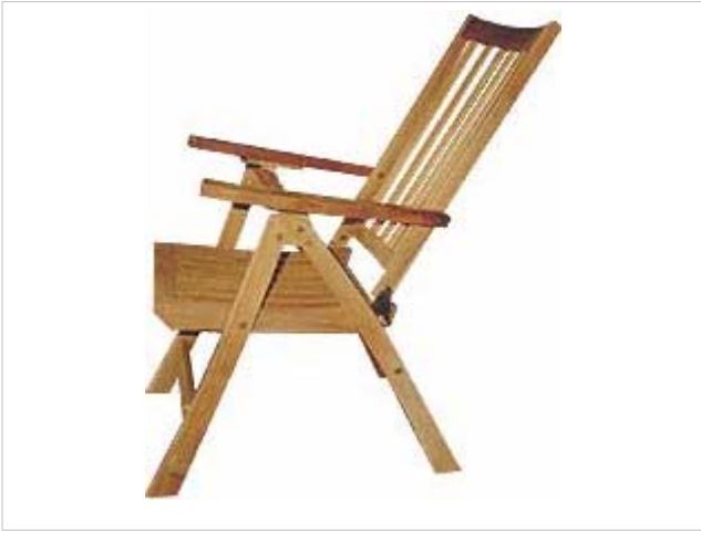
CODE: EB - 061 DORSET CHAIR B SIZE: W 65 x D 60 x H 110 (cm)