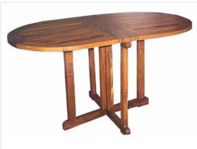
CODE: EB - 099B ELIPSE BUTTERFLY TABLE SIZE: W 120 X D 60 x H 75 (cm)