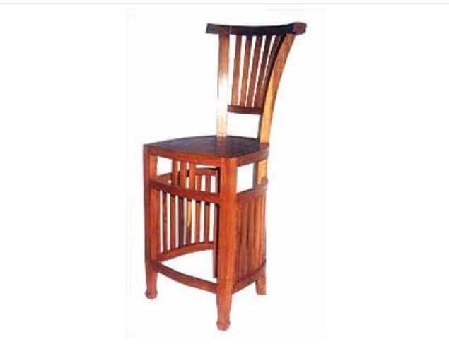
CODE: EB -018B BAR STOOL BABY "RACAK" CHAIR SIZE: W 40 x D 40 x H 110 (cm)