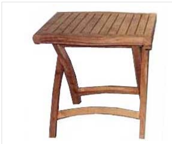
CODE: EB - 114 TURTLE SQUARE TABLE SMALL SIZE: W 48 x D 43 x H 56 (cm)