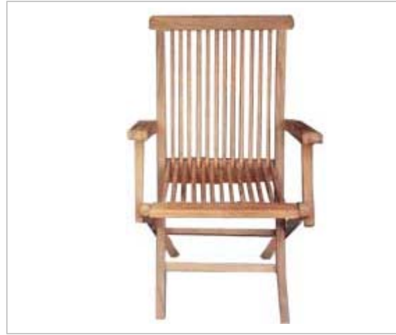
CODE: EB - 056 ARM FOLDING CHAIR SMALL SIZE: W 55 x D 45 x H 90 (cm)