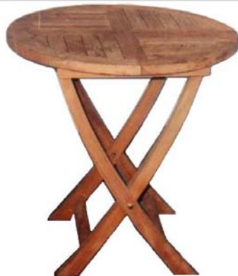
CODE: EB - 105 ROUND FOLDING TABLE A SIZE: Ø 70 x H 75 (cm)