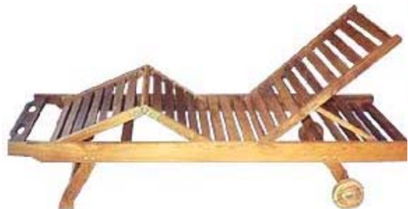
CODE: EB - 089 SUN BED FOLDING 3 SIZE: W 200 x D 70 x H 45 (cm)