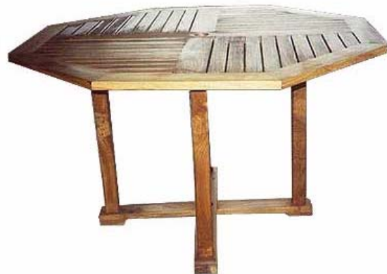
CODE: EB - 093 OCTAGONAL TABLE STAND LEGS SIZE: Ø 120 x H 75 (cm)