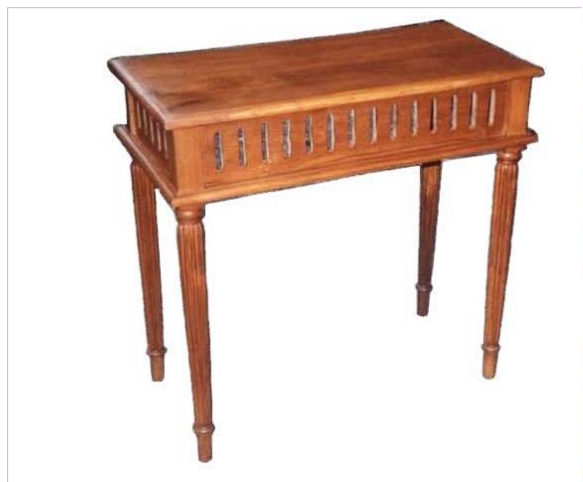
CODE: EB - 144 SIDE TABLE CAPSUL SMALL SIZE: W 80 x D 40 x H 75 (cm)