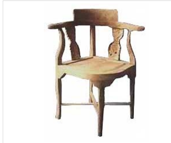
CODE: EB -002 GRAPPE CHAIR SIZE: W 65 x D 50 x H 80 (cm)