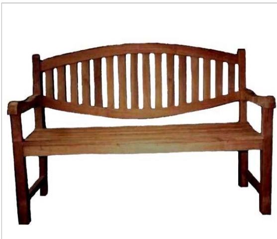
CODE: EB - 068 OVAL GARDEN BENCH SIZE: W 120,150,180 x D 55 x H 100 (cm)