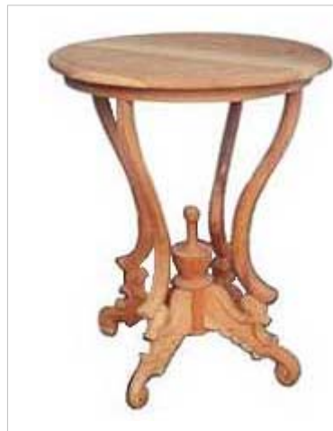
CODE: EB - 130 ROUND FLOWER TABLE SIZE W 60 x D 60 x H 75(cm)