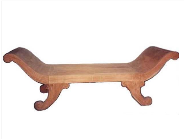
CODE: EB - 080 LENONG BENCH SIZE: W 150 x D 56 x H 57 (cm)