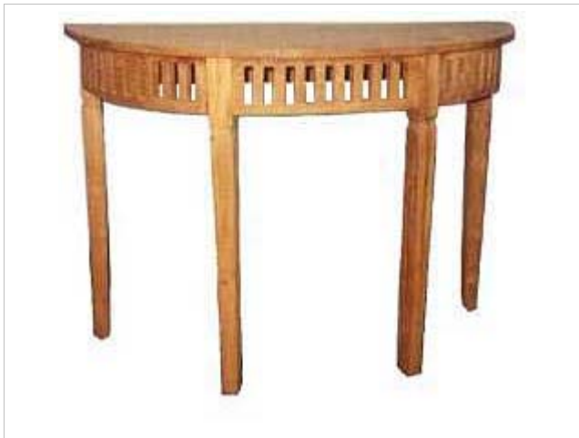
CODE: EB - 133 CONSUL CAPSUL TABLE LARGE SIZE: W 105 x D 45 x H 75 (cm)