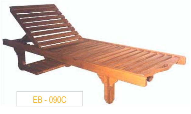
EB - 090C