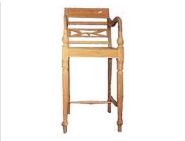
CODE: EB -019 BAR STOOL BATAVIA CHAIR SIZE: W 50 x D 50 x H 110 (cm)