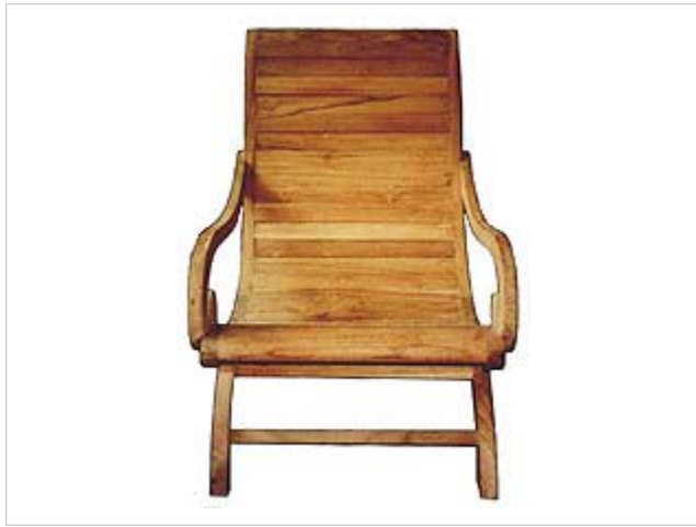
CODE: EB - 026 LAZY WOODEN CHAIR SMALL SIZE: W 65 x D 95 x H 95 (cm)