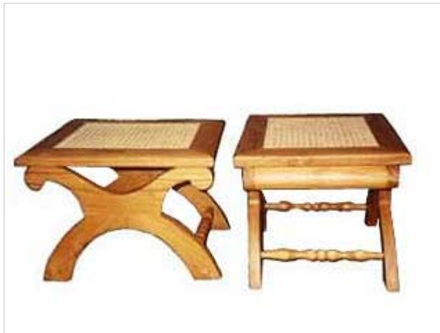
CODE: EB - 126 SMALL RATTAN TABLE SIZE: W 50 x D 40 x H 35 (cm)