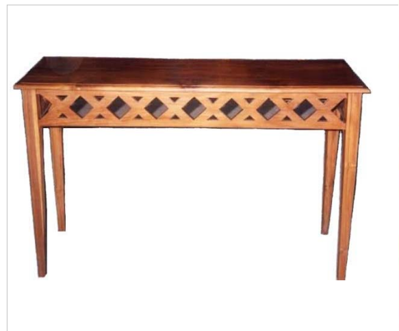
CODE: EB - 142 SIDE TABLE CROSS LARGE SIZE: W 120 x D 40 x H 75 (cm)