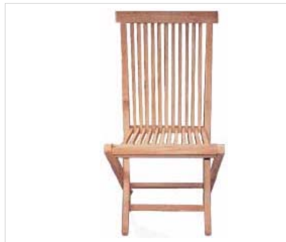
CODE: EB - 058 FOLDING CHAIR SMALL SIZE: W 45 x D 45 x H 90 (cm)