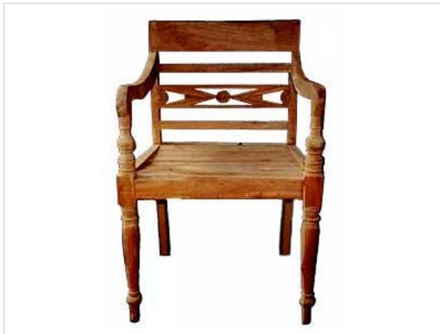
CODE: EB -023 BATAVIA CHAIR B SIZE: W 55 x D 55 x H 85 (cm)