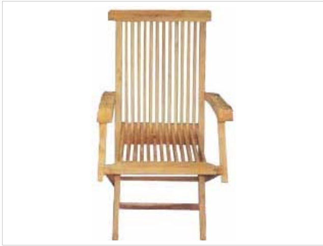
CODE: EB - 055 ARM FOLDING CHAIR HIGH BACK SIZE: W 55 x D 45 x H 100 (cm)