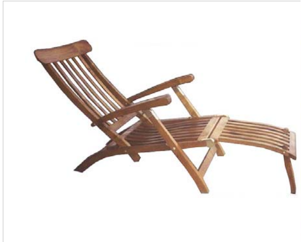
CODE: EB - 047 STEAMER CHAIR SIZE: W 60 x D 150 x H 95 (cm)