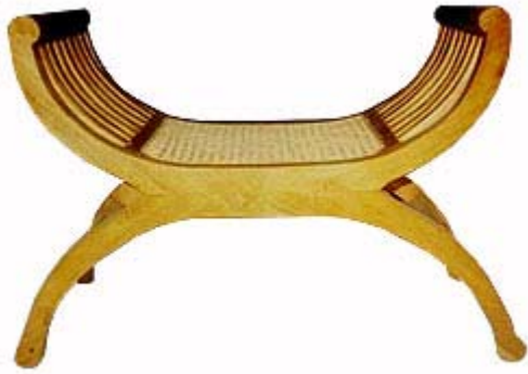
CODE: EB - 084 ROMAN RATTAN CHAIR SMALL SIZE: W 77 x D 40 x H 60 (cm)