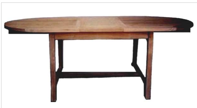
CODE: EB - 094 OVAL EXTENSION TABLE SIZE: W 200 / 150 x D 100 x H 75 (cm) W 240 / 180 x D 110 x H 75