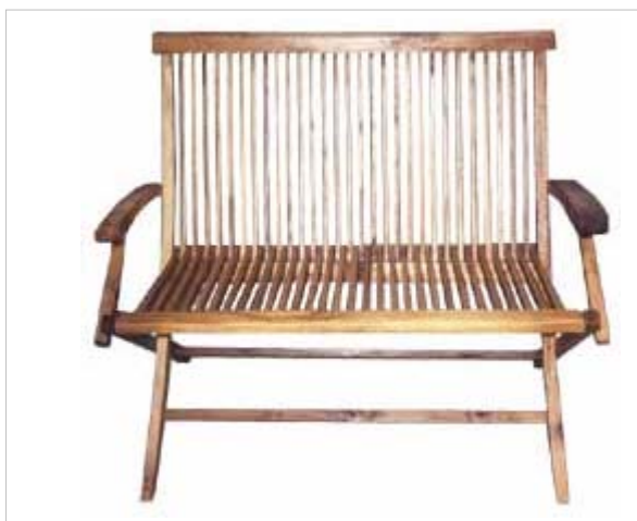
CODE: EB - 077 ARM FOLDING BENCH SIZE: W 100 x D 45 x H 100 (cm)