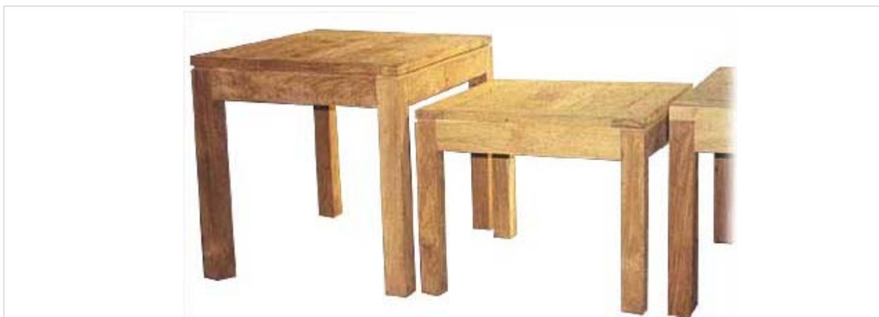
CODE: EB -111 SQUARE TABLE S.LEG SMALL SIZE: W 45 x D 45 x H 45 (cm)