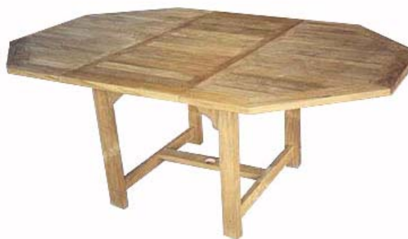
CODE: EB - 095 OCTAGONAL EXTENSION TABLE A SIZE: W 170 / 120 x D 120 x H 75 (cm)