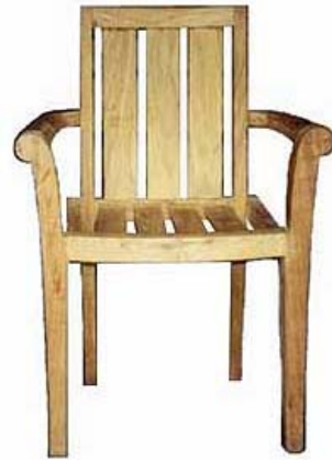
CODE: EB - 035 STACKING CHAIR SIZE: W 65 x D 50 x H 90 (cm)