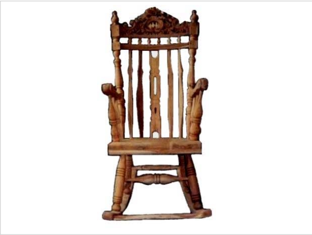
CODE: EB - 046 ROCKING CHAIR SIZE: W 50 x D 110 x H 125 (cm)