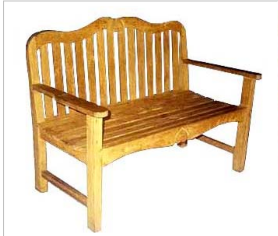
CODE: EB - 079 GARDEN BENCH ROSE SIZE: W 135 x D 50 x H 95 (cm)