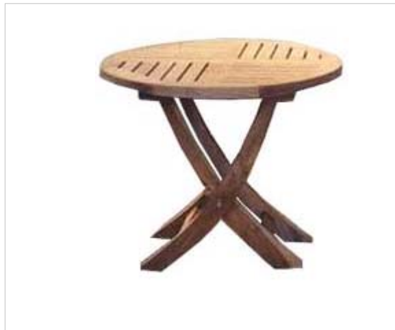
CODE: EB - 116 ROUND TABLE SMALL SIZE: Ø 50 x H 45 (cm)