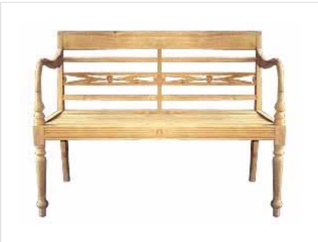
CODE: EB - 074 BATAVIA BENCH 2 SEAT SIZE: W 115 x D 50 x H 90 (cm)