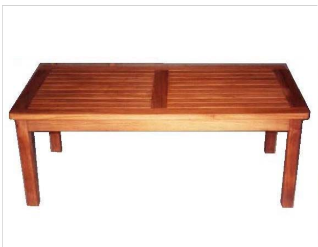
CODE: EB - 123 COFFEE TABLE SIZE: W 120 x D 60 x H 50 (cm)