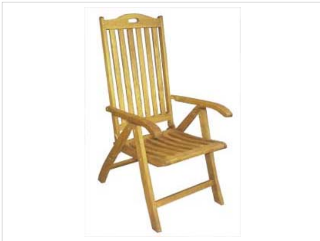
CODE: EB - 065 SLUMBER CHAIR D SIZE: W x D x H (cm)