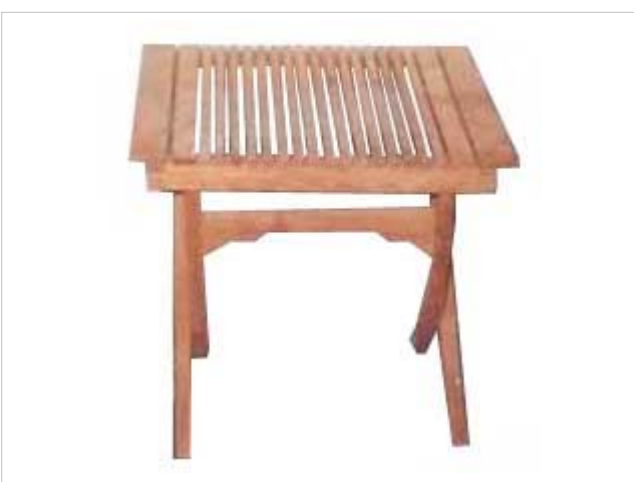
CODE: EB-118 SQUARE TABLE "RUJI" SMALL SIZE: W 50 x D 50 x H 45 (cm)