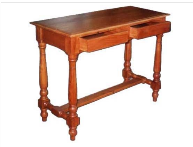
CODE: EB -143 SIDE TABLE 2 DRAWS SIZE: W 95 x D 50 x H 75 (cm)