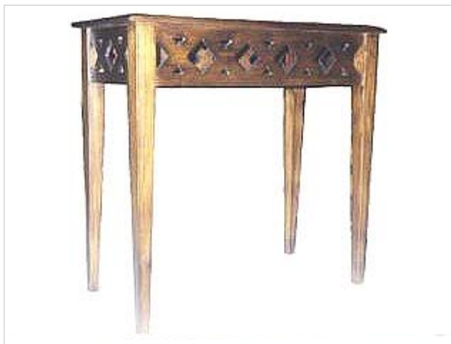
CODE: EB - 141 SIDE TABLE CROSS SMALL SIZE: W 80 x D 40 x H 75 (cm)