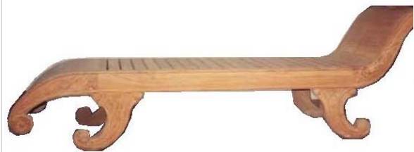
CODE: EB - 087 SUN BED LENONG SIZE: W 195 x D 60 x H 70 (cm)