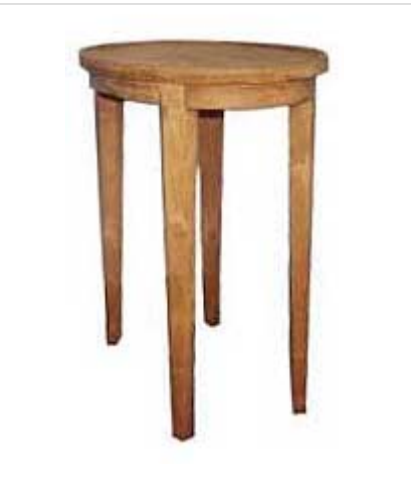
CODE: EB - 129 OVAL TEA TABLE SMALL SIZE: W 70 x D 50 x H 75 (cm)