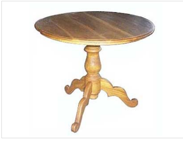
CODE: EB - 148 ROUND TABLE ONE LEG BUBUT B SIZE: W 100,80 x D 100,80 x H 75 (cm)