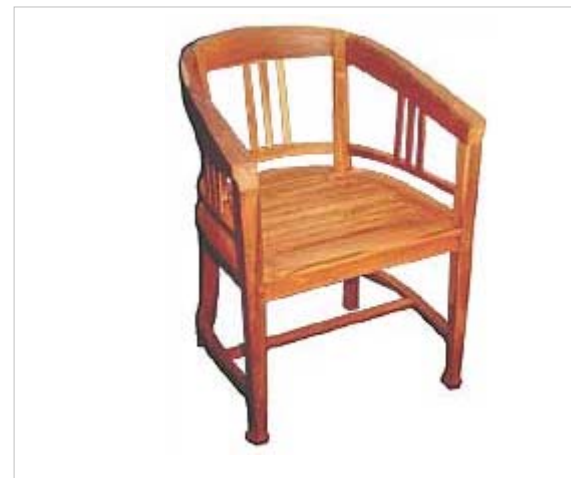
CODE: EB -024 U PRESS WOODEN CHAIR SIZE: W 60 x D 55 x H 85 (cm)