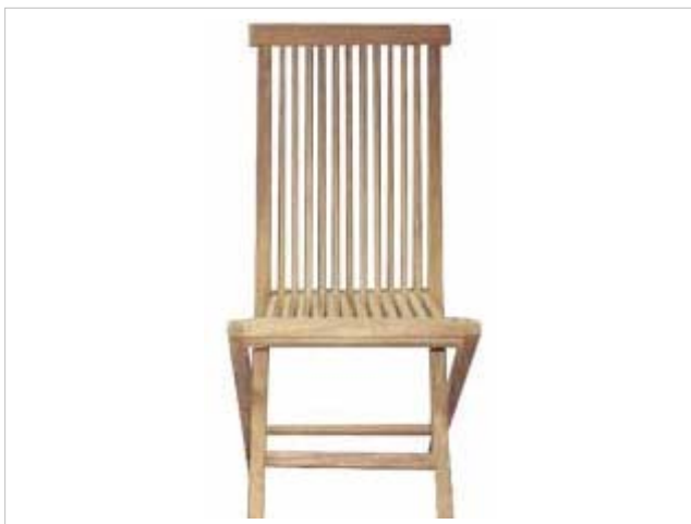
CODE: EB - 059 FOLDING CHAIR HIGH BACK SIZE: W 45 x D 45 x H 100 (cm)