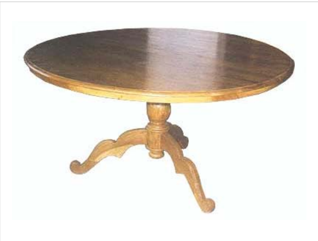
CODE: EB - 147 ROUND TABLE ONE LEG BUBUT A SIZE: W 120 x D 120 x H 75 (cm)