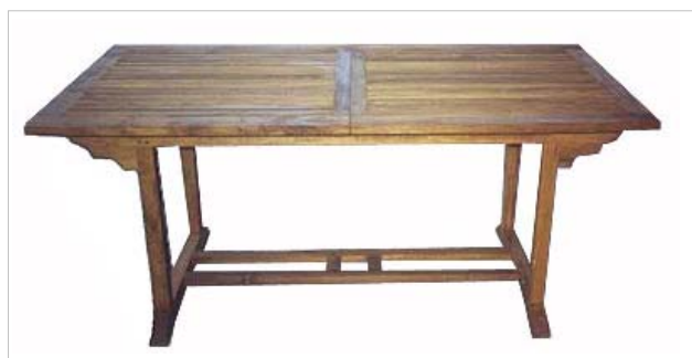
CODE: EB - 092 RECTANGULAR EXT. TABLE SIZE: W 240 / 180 x D 90 x H 75 (cm)