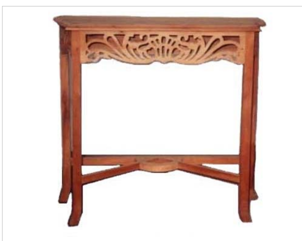
CODE: EB -138 SIDE TABLE "KRAWANG" SMALL SIZE: W 90 x D 30 x H 75 (cm)