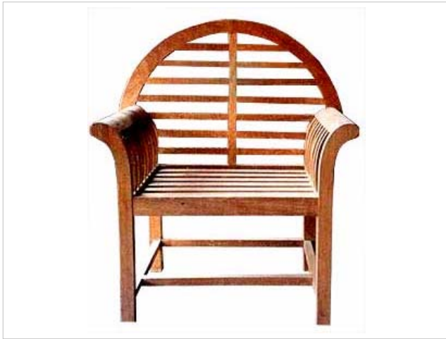
CODE: EB -001 KIPAS GARDEN CHAIR SIZE: W 72 x D 48 x H 92 (cm)