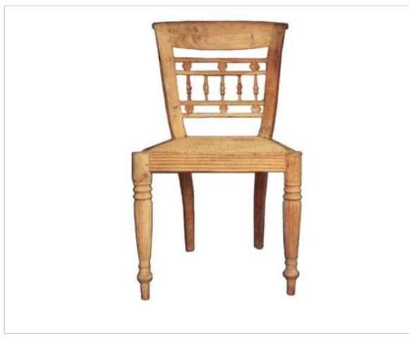
CODE: EB -009 RAFFLES RATTAN CHAIR SIZE: W 45 x D 50 x H 85 (cm)